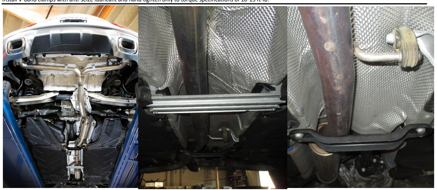
Page 1 of 2

Install V-band clamps with anti-seize lubricant and hand tighten only to torque specifications of 10-15 ft-lb.