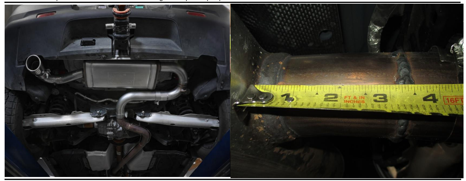
Page 1 of 2

Install V-band clamps with anti-seize lubricant and hand tighten only to torque specifications of 10-15 ft-lb.