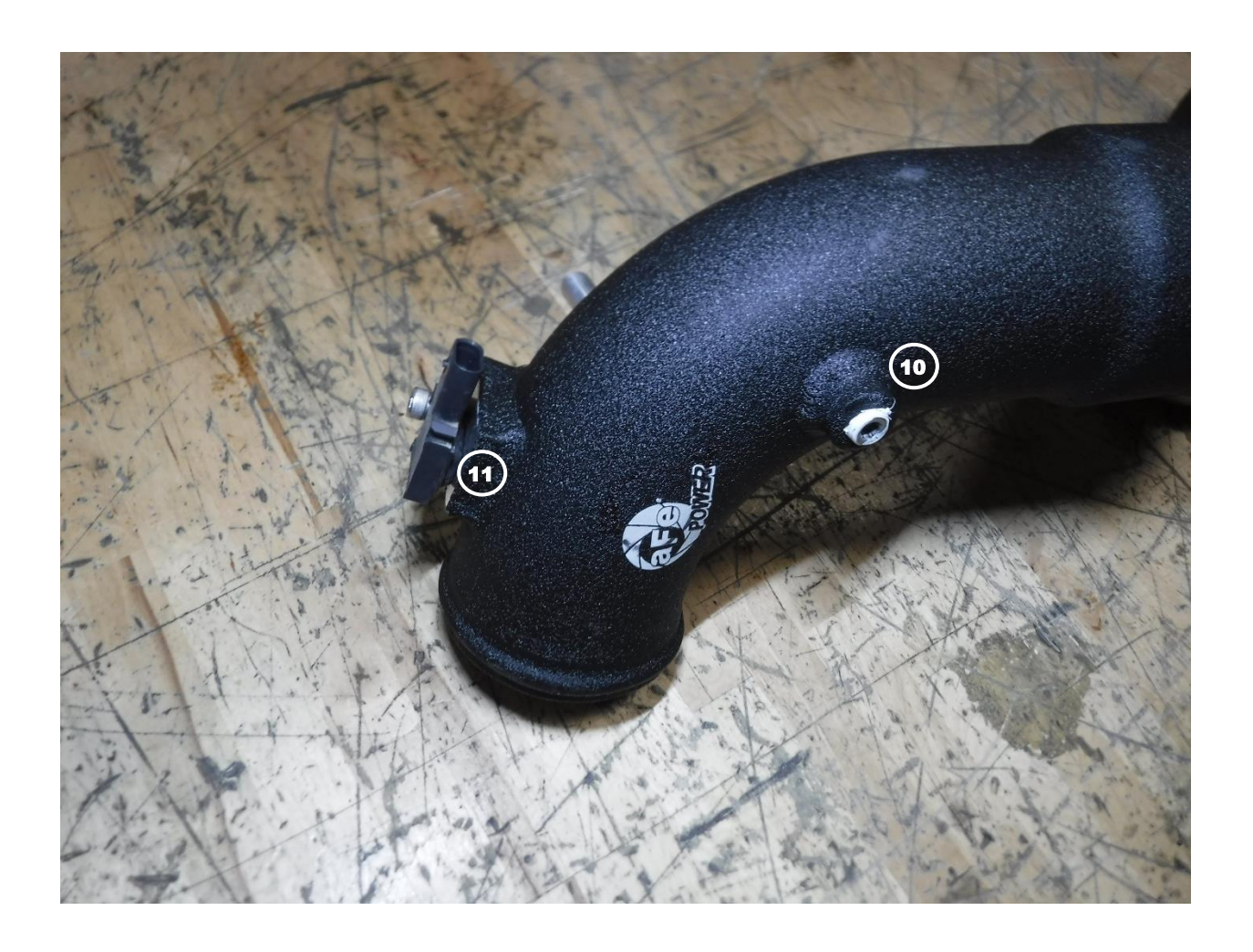
Note: Be sure to use thread sealant on the plugs or sensors to prevent any leaking.