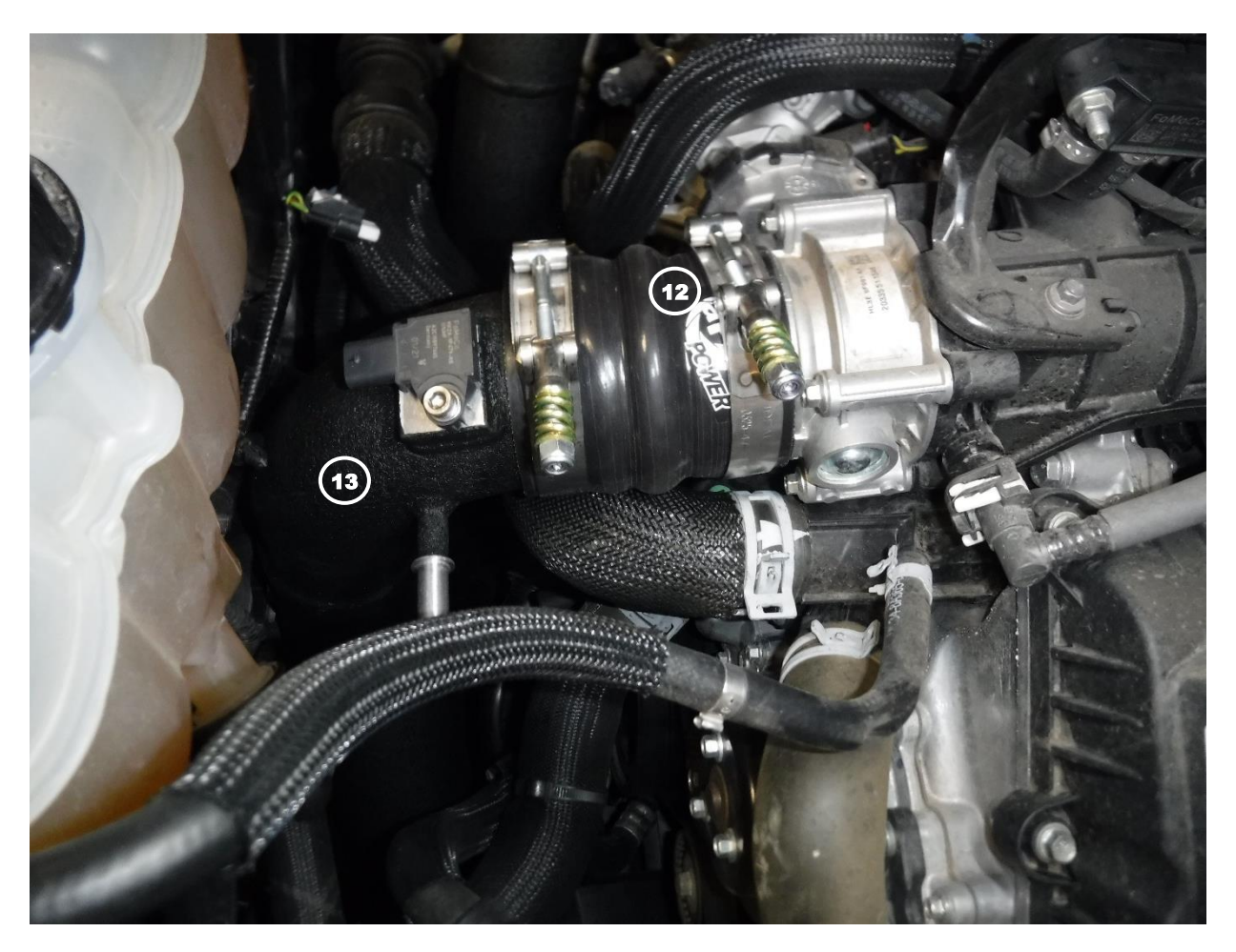
Note: Be sure to thoroughly clean all oil residue off of the connections before installing any of the aFe couplings onto the vehicle.