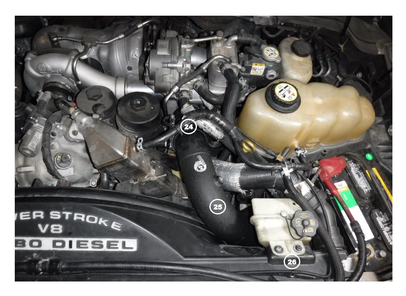
Note: Be sure to thoroughly clean all oil residue off of the connections before installing any of the aFe couplings onto the vehicle