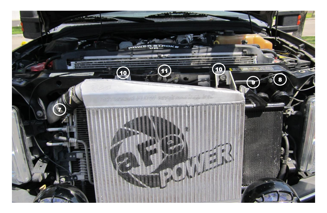
Note: It is recommended to trim the core support for the fitment of this charge pipe.