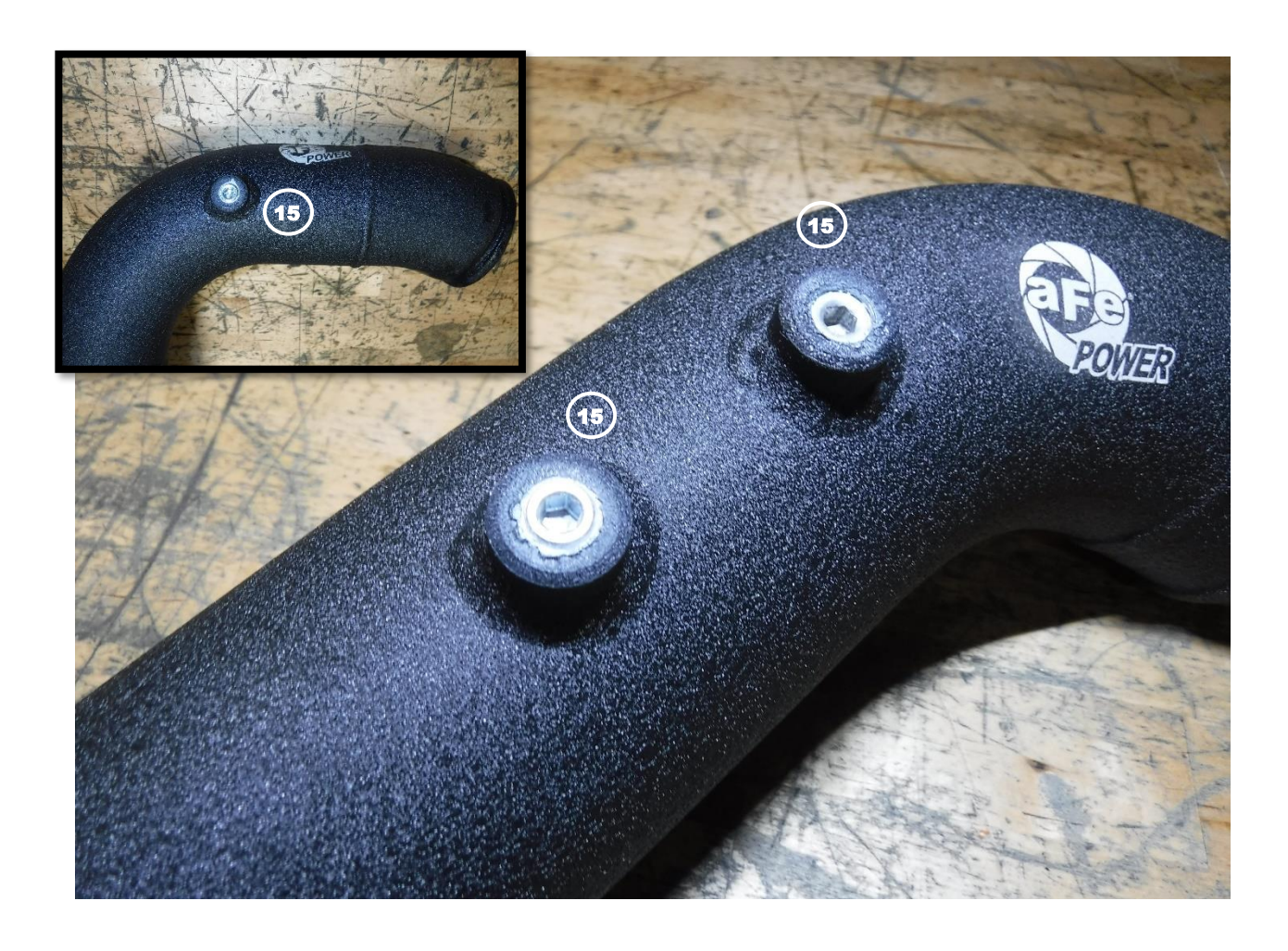
Note: Be sure to use thread sealant on the plug or sensor to prevent any leaking

26. If you are not using any aftermarket sensors, install the supplied 1/8" NPT plugs (15) into the threaded fittings on the aFe charge pipes.