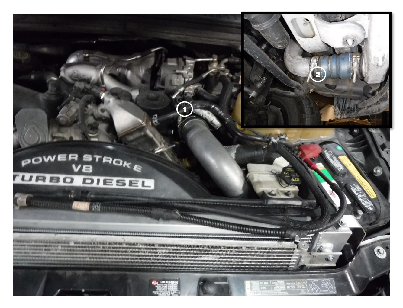
Note: it is recommended to remove the radiator from the vehicle in order to remove the factory hot side charge pipe for reuse later. The factory charge pipe can also be cut in half and removed from the vehicle if there are no plans for reusing it in the future.