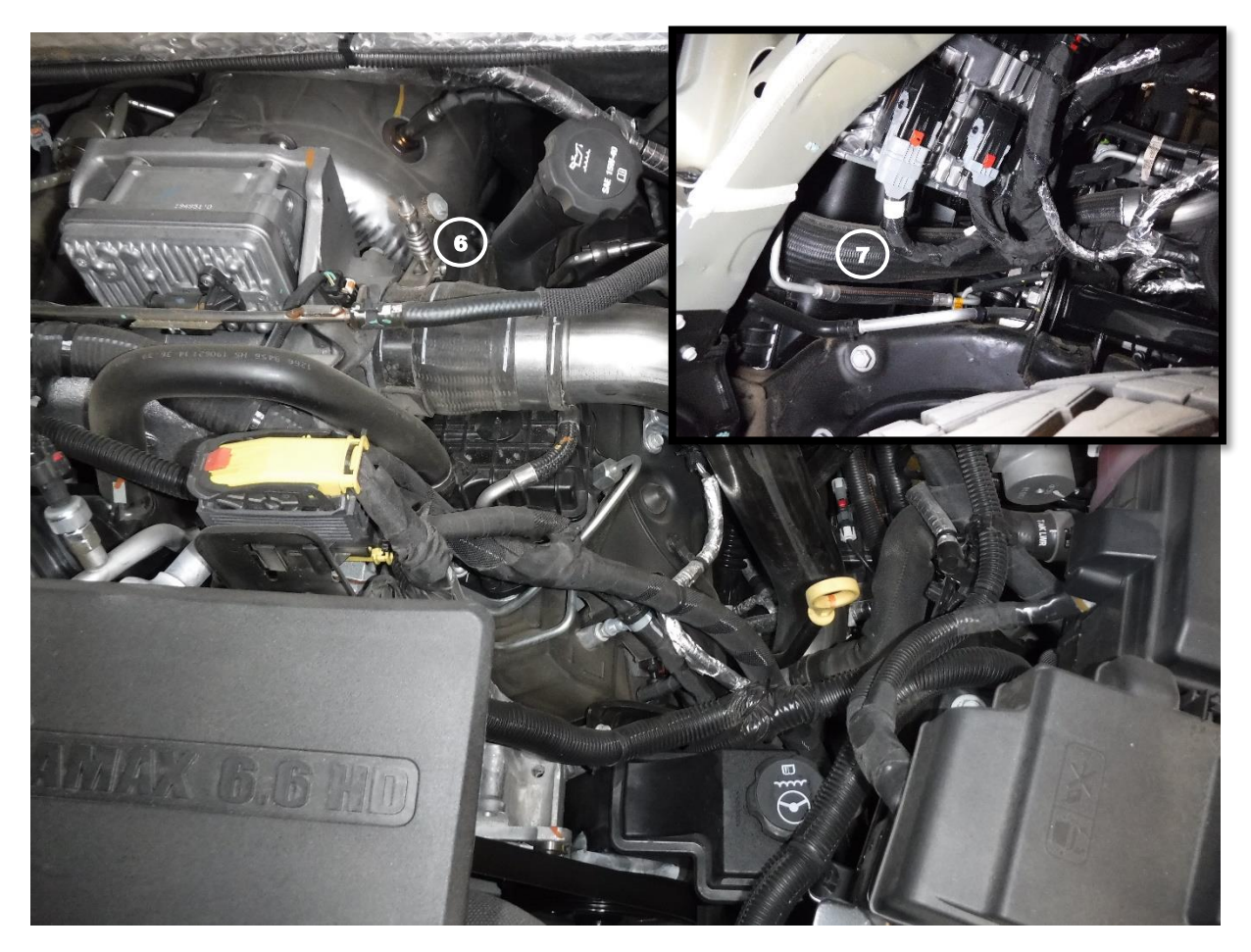
<u>It may be necessary to use a pick to break the connection between the charge pipe couplings and the vehicle in order to disconnect the couplings.</u>