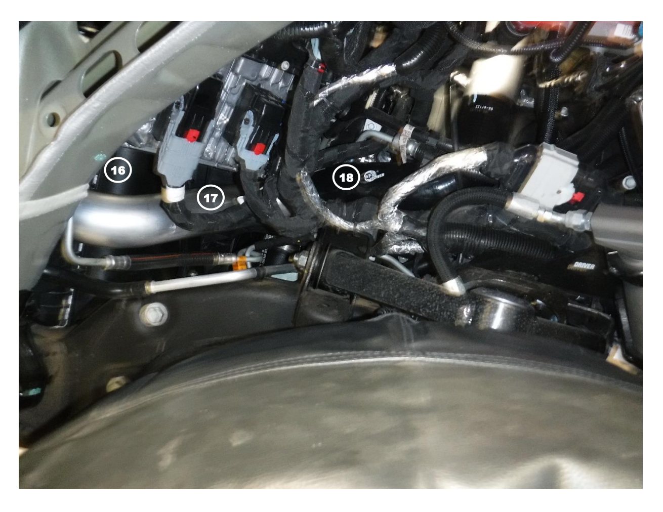
Note: Be sure to thoroughly clean all oil residue off of the connections before installing any of the aFe couplings onto the vehicle.