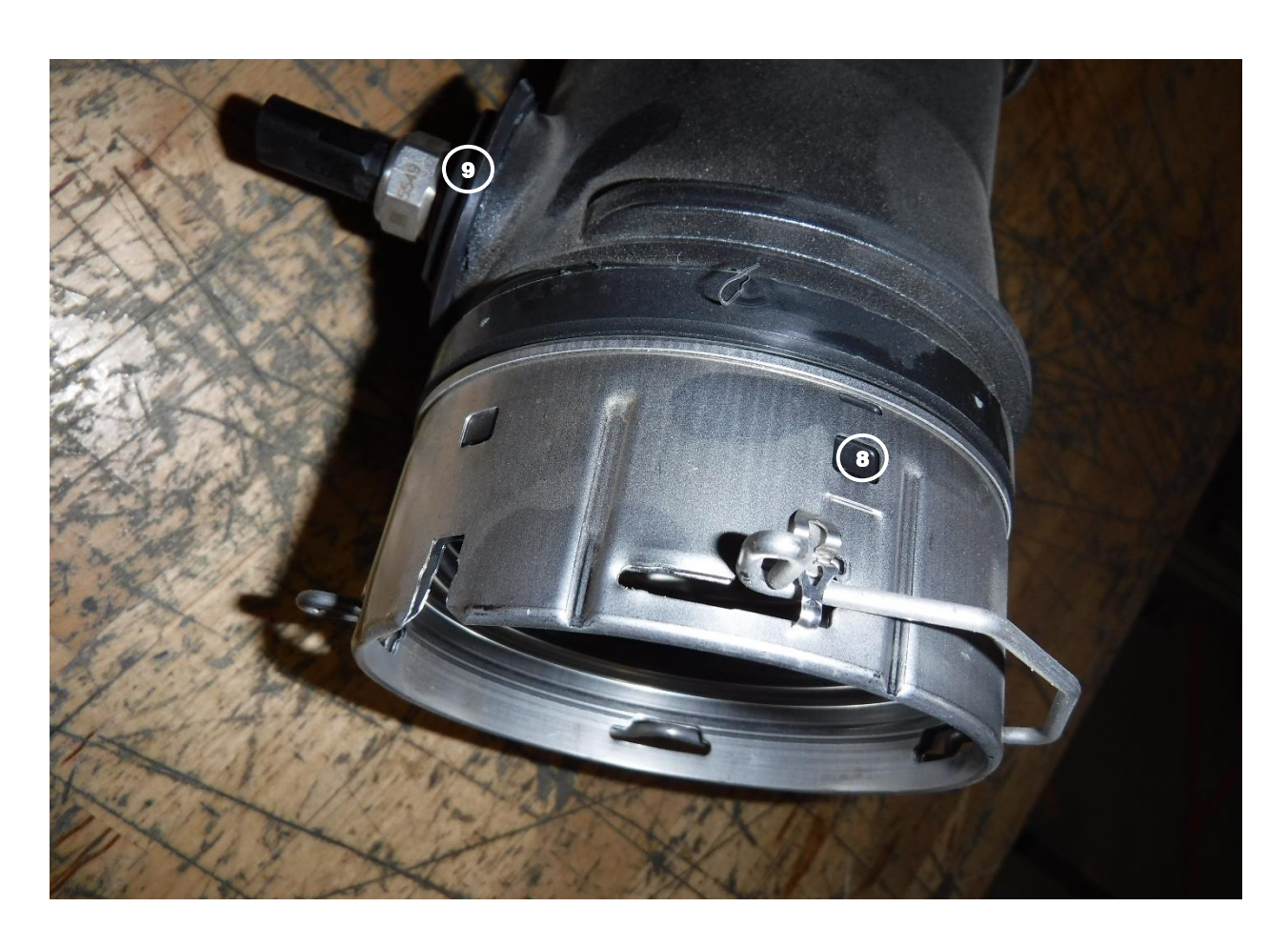
Note: The retaining clips will need to be removed from both ends of the factory cold side charge pipe for reuse with the aFe charge pipe.