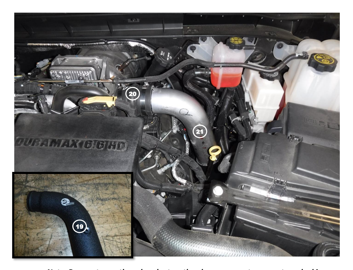
Note: Be sure to use thread sealant on the plug or sensor to prevent any leaking