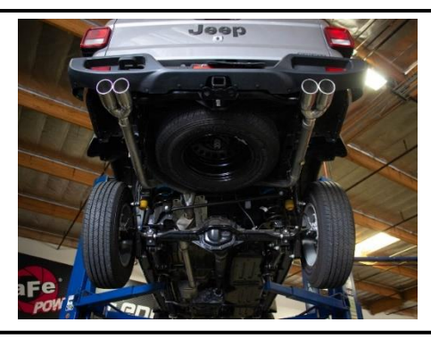
Page 1 of 2

Install band clamps to proper torque specifications of 40-45 ft-lb.