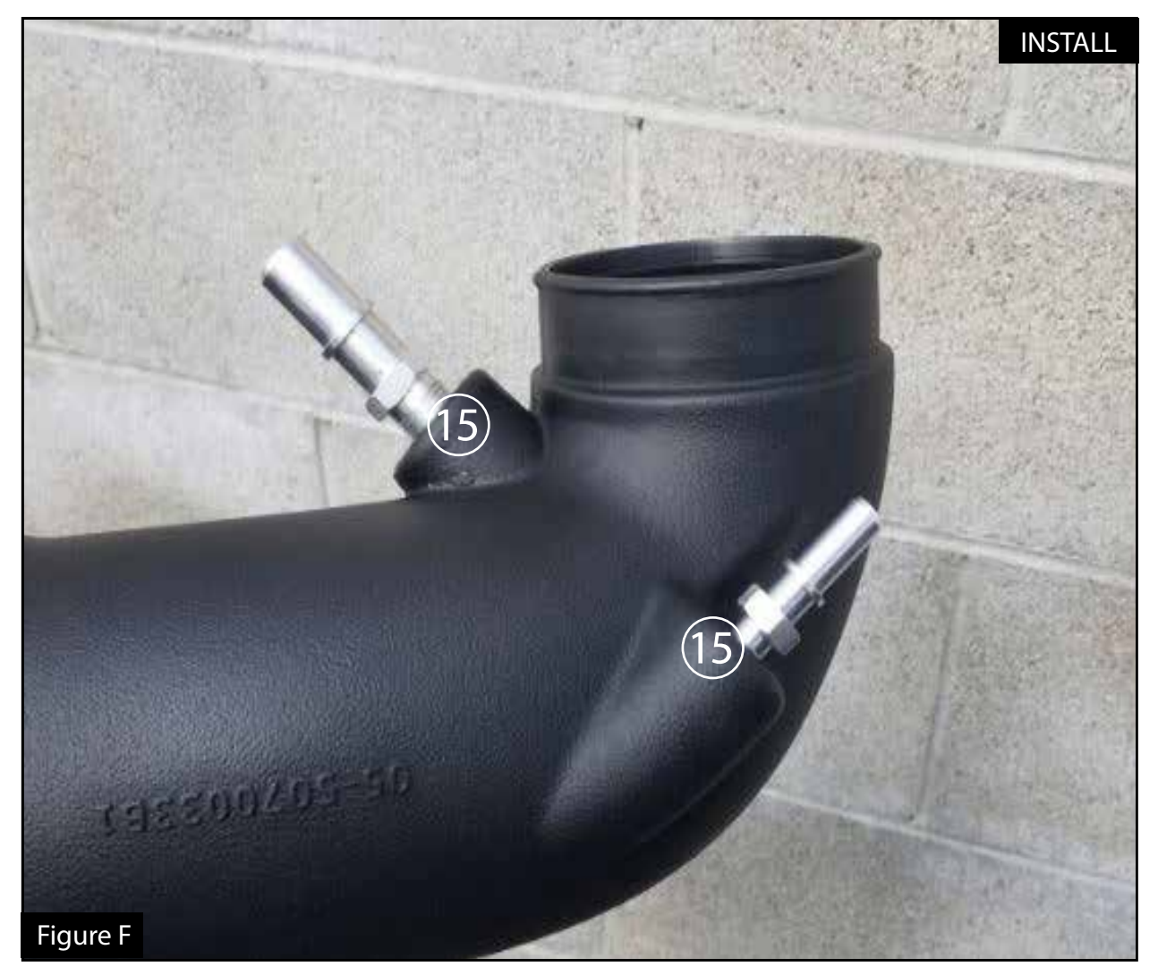
Refer to Figure F for Step 16