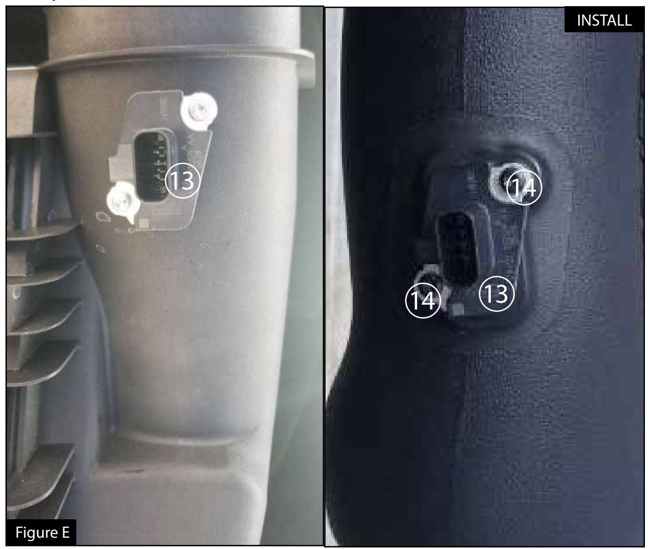
Refer to Figure E for Steps 14-15

Step 14: Remove the MAF sensor (13) from the factory air box using a T20 torx bit.