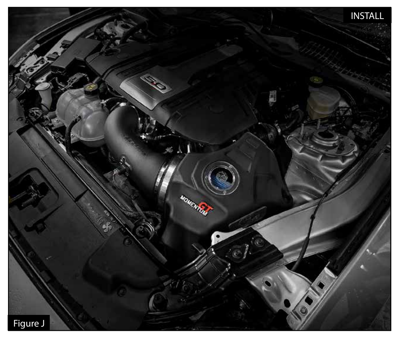
Refer to Figure J for Steps 26-27

Step 26: Ensure all clamps are tightened and fully secured.