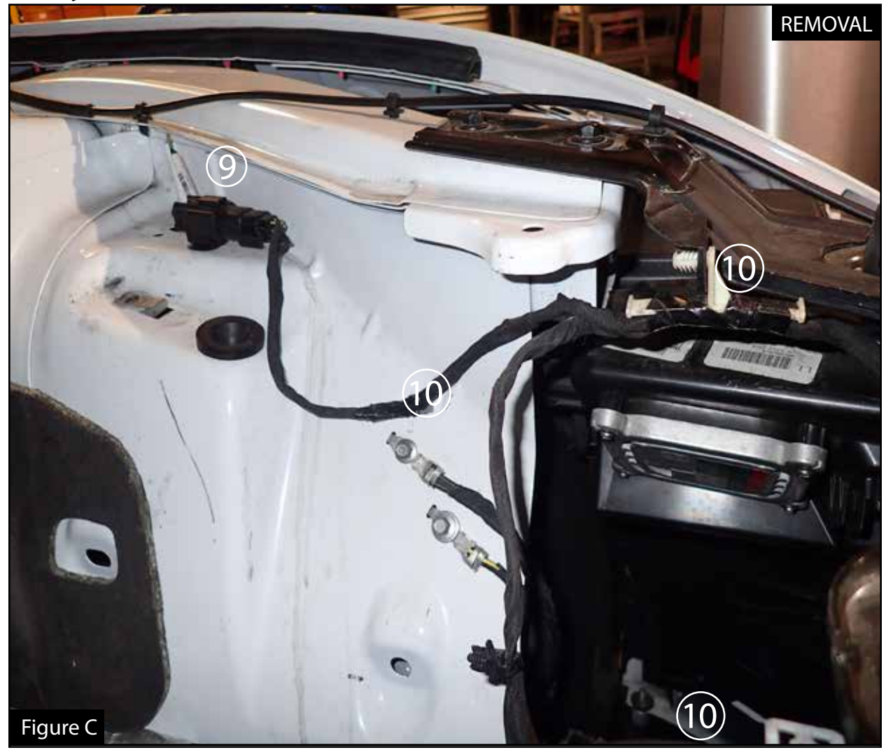
Refer to Figure C for Steps 9-10

Step 9: Relocate the terminal connector, located on the fender well, to the hole nearest the front of the vehicle as shown. 9