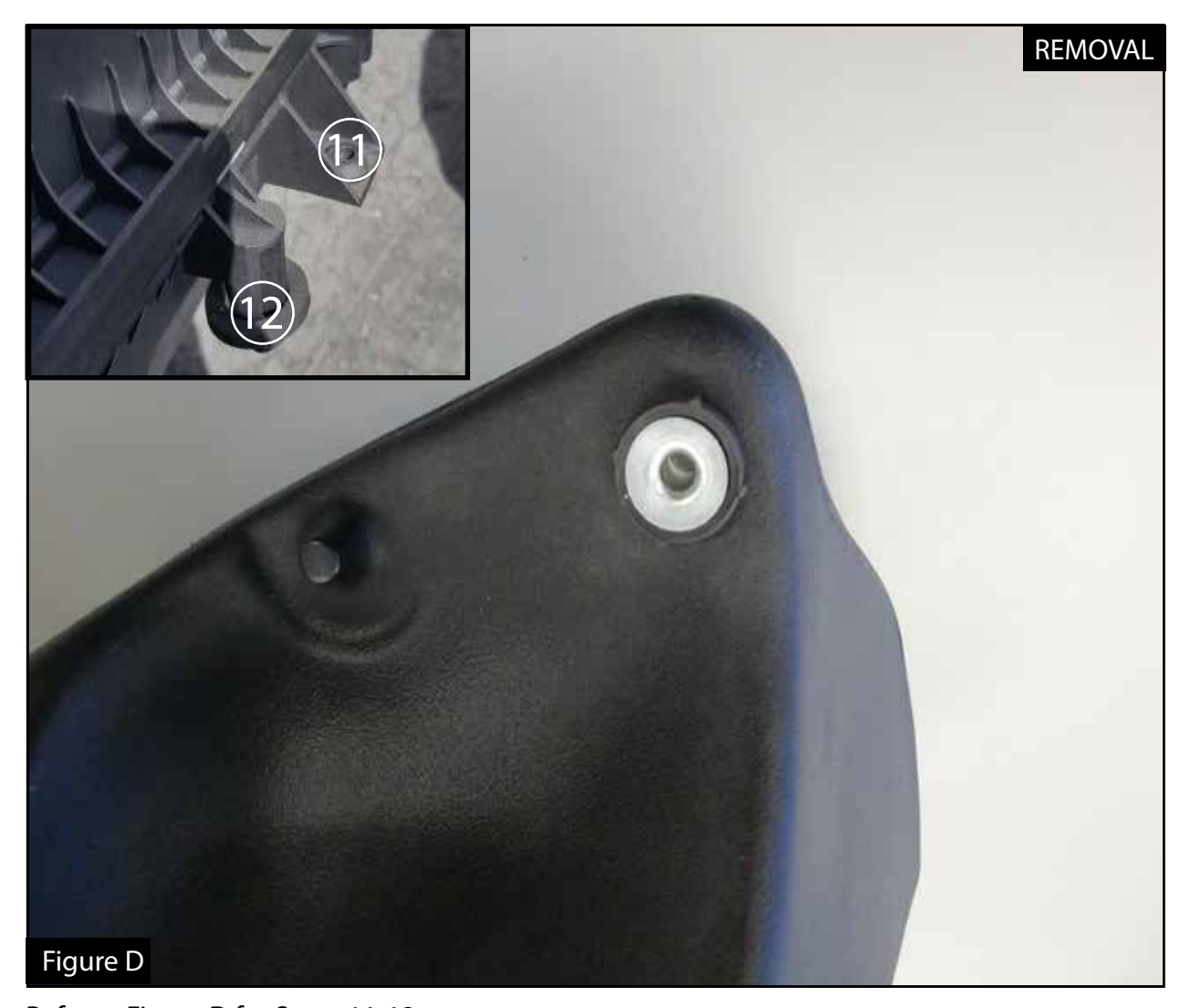
Refer to Figure D for Steps 11-13

Step 11: Pull out the metal sleeve and rubber grommet (1) from the factory air box.