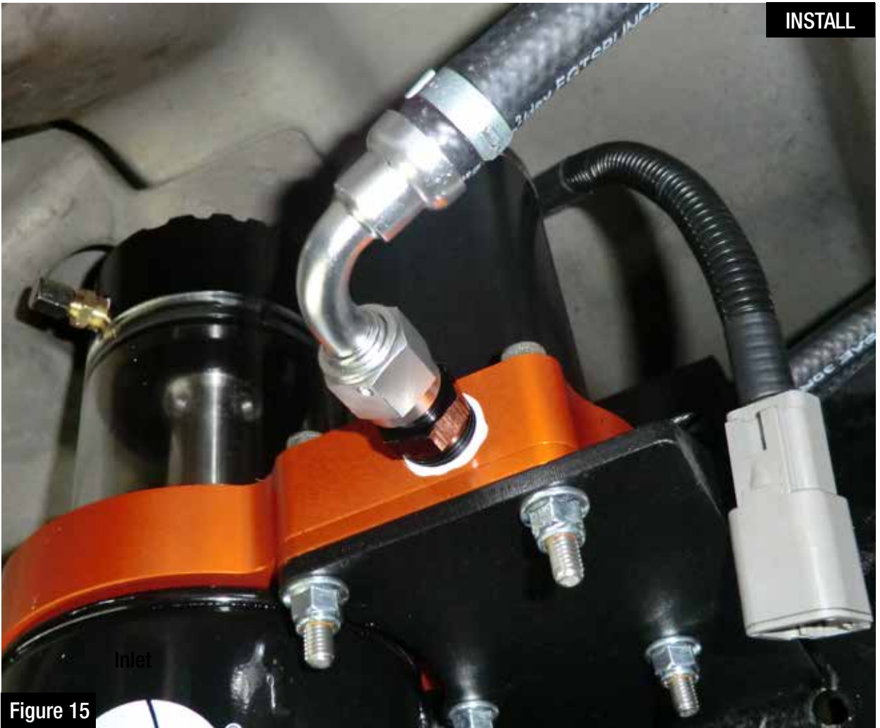
Step 15: Install the supply fuel line (90° silver “AN” fitting) onto the fuel inlet port of the DFS780.