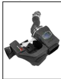
Intake System "Momentum"

P/N: 50-73002 (P10R) 51-73002 (PDS) 75-73002 (PG7)