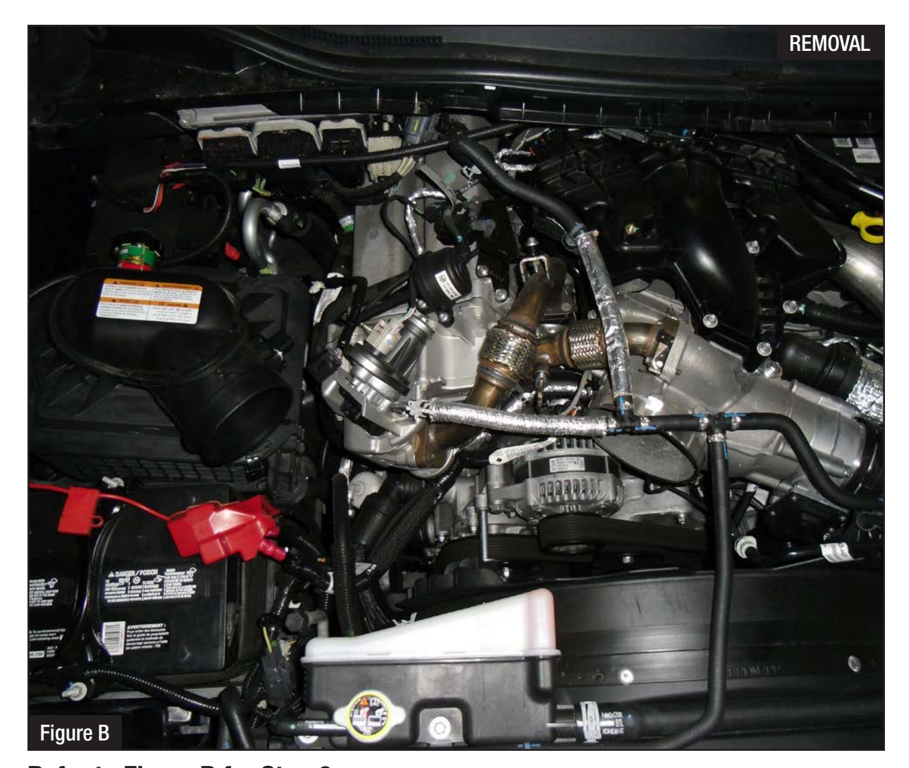
Refer to Figure B for Step 2

Step 2: Push the small hoses out of the way on the OE tube, and remove the tube.