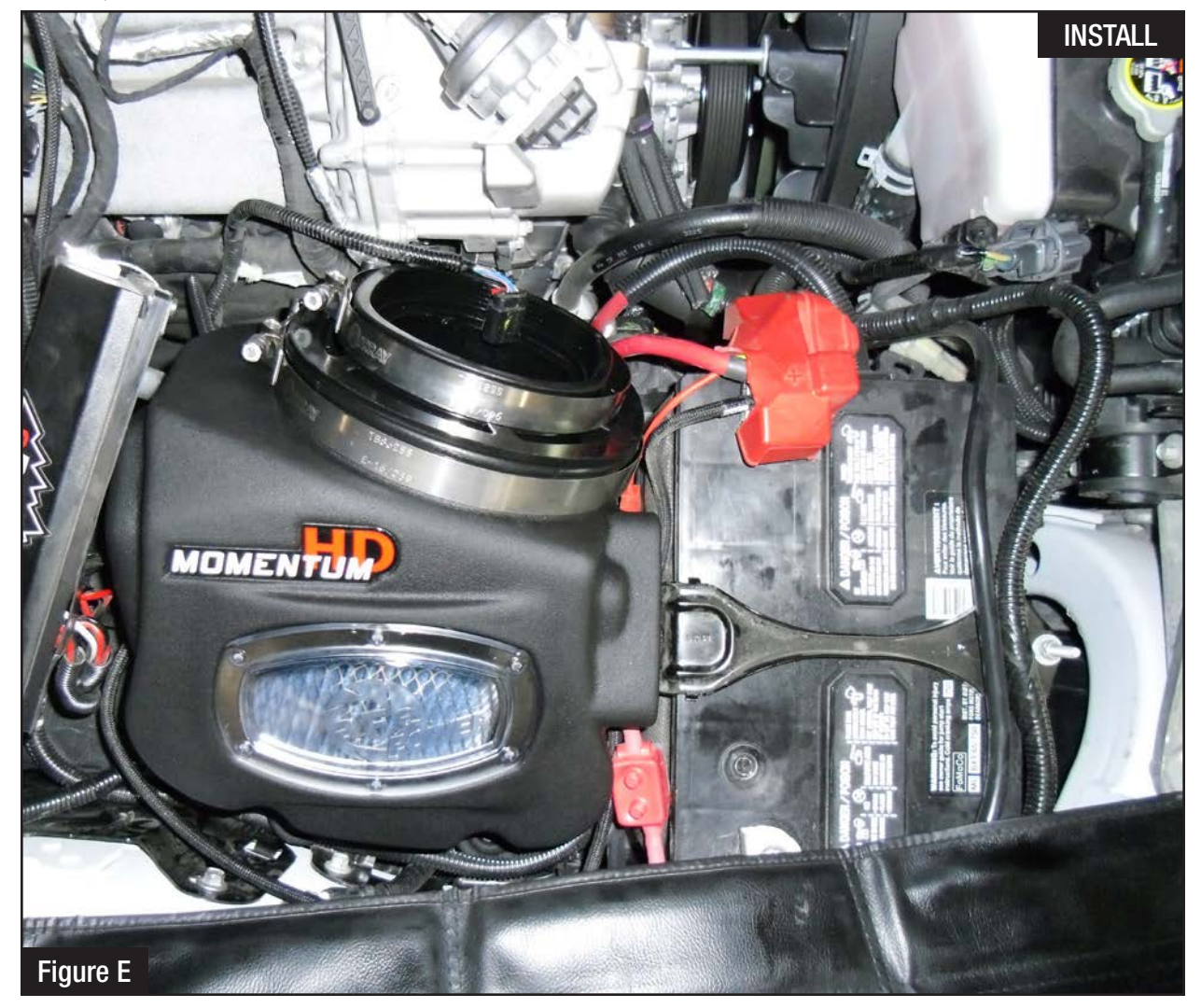
Refer to Figure E for Step 7

Step 7: Install the Momentum HD housing into the vehicle by pushing it in to the factory grommet.