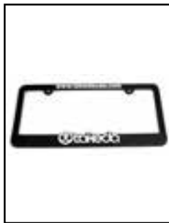
Lic. Plate Frame