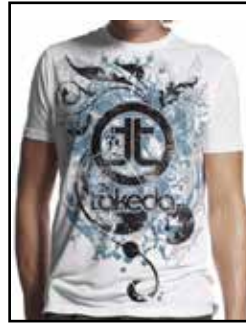
Takeda Tee Shirt

P/N: TP-7004T M P/N: TP-7005T L P/N: TP-7006T XL P/N: TP-7007T 2XL