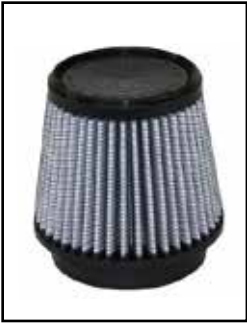
Pro DRY S Air Filter