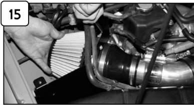
15 Install air filter and tighten using 5/16" nut driver.