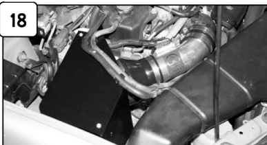
18 The installation of your Takeda performance intake is now complete. Please check all components and re-tighten if necessary. Thank you for choosing Takeda!