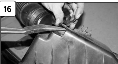
16 Remove clips from upper half of air box. Attach onto new cover.