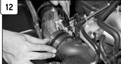
12 Install and position new tube to throttle body and filter adaptor.