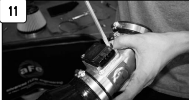
11 Install MAF sensor on intake tube using M4 screws provided. Attach couplers with clamps to intake tube.