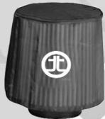
Pre Filter P/N: TP-7011B

Note: Filter Cleaning: When cleaning your Pro Dry 5™ filter, be sure to use only "Restore Kit" (Takeda P/N: TP-7015C Pro Dry 5™ cleaner only.)