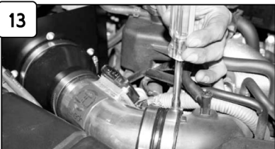
13 Tighten all clamps using 5/16" nut driver.