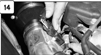
14 Re-connect MAF sensor harness.