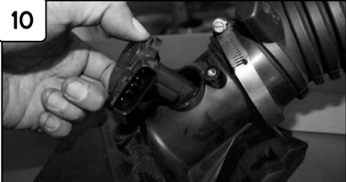
10 Remove MAF sensor from stock intake.