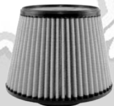
Replacement Filter P/N: TF-9007D