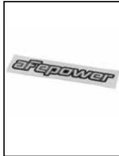
aFe Power Decal