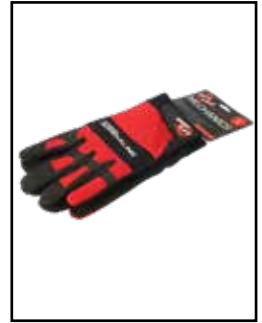
aFe Power Gloves