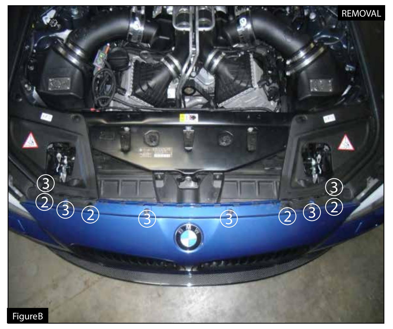
Refer to Figure B for step 2

Step 2: Remove the plastic clips 2 and the T30 screws 3 securing the top part of the bumper.