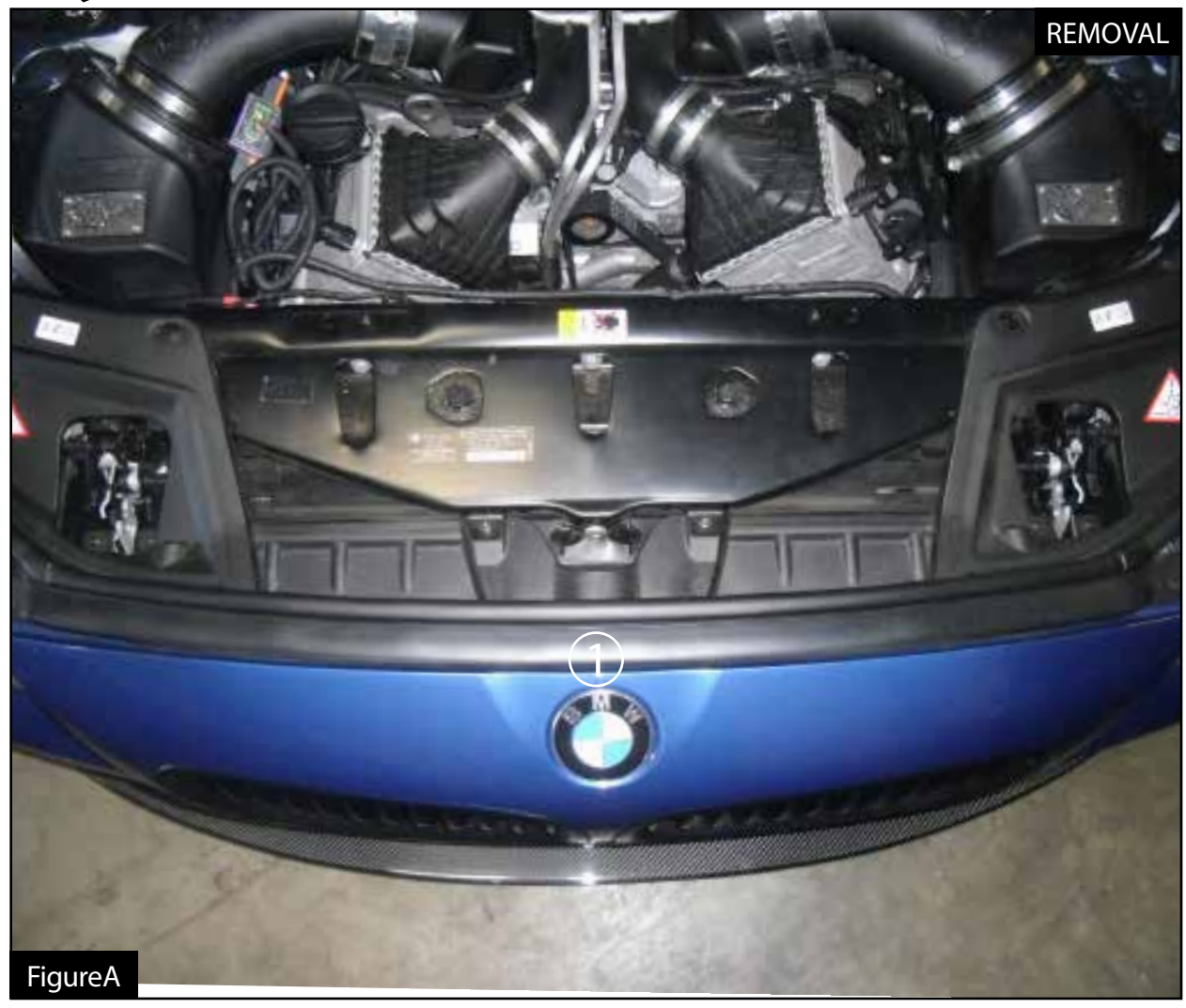
Refer to Figure A for step 1

Step 1: Remove the seal trim on the front bumper rail (1).