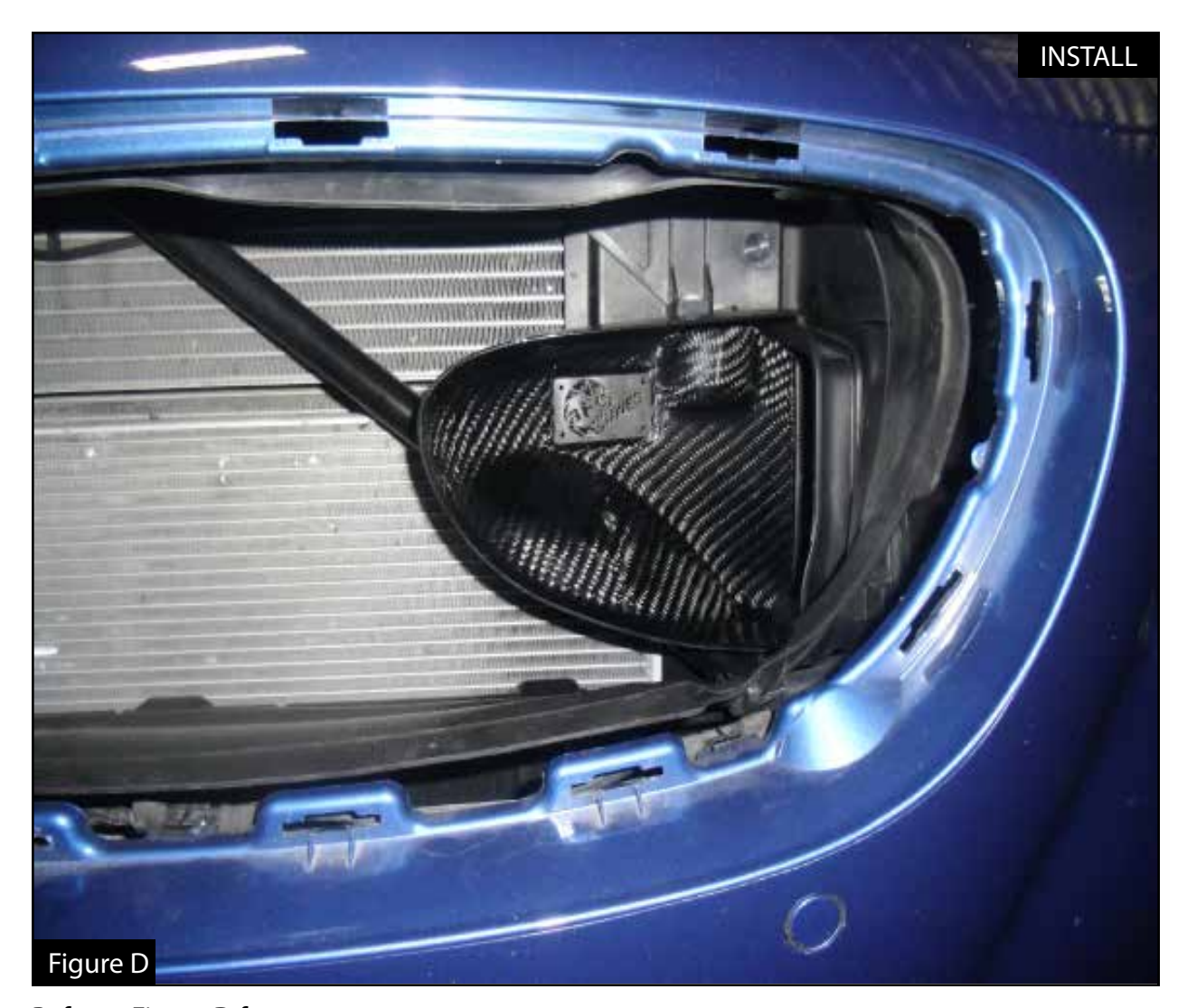
Refer to Figure D for step 5