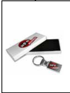
aFe Key Chain