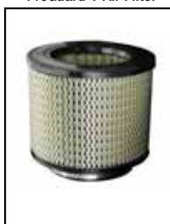
ProGuard-7 Air Filter