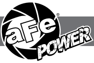
Pro DRY S Air Filter