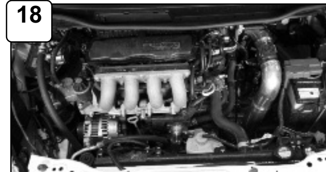
18 The installation of your Takeda performance intake is now complete. Please check all components and re-tighten if necessary. Thank you for choosing Takeda!