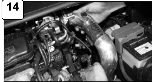
14 Position tab to mounting point and coupler.