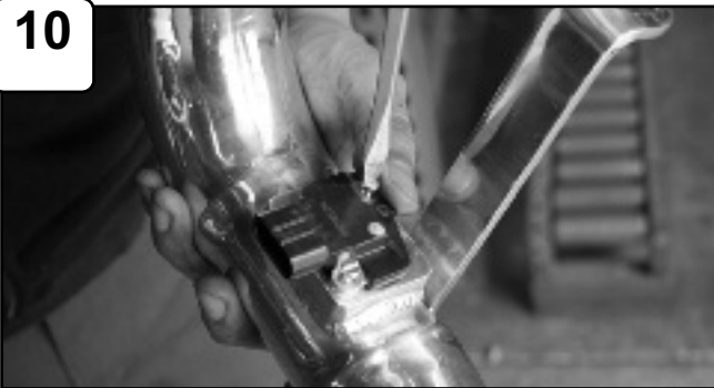
10 Install MAF sensor to intake tube using provided M4 screws.

For replacement part(s) or "Restore Kit" please log on to takedausa.com P.O. Box 1719 Corona CA, 92878