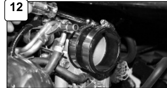
12 Install straight coupler to throttle body and position using clamps provided. Do not tighten.