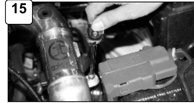
15 Tighten down intake using provided flat washer, wavy washer and hex screw.