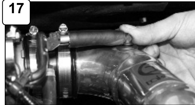
17 Using the supplied 3/8" elbow, hose and grommet, reattach the crank case line. Re-connect MAF sensor harness and battery terminals.