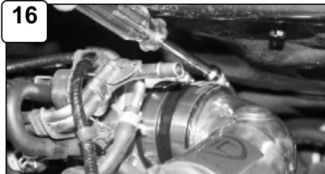
16 Tighten all clamps using 5/16" nut driver.