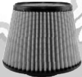
Replacement Filter P/N: TF-9002D