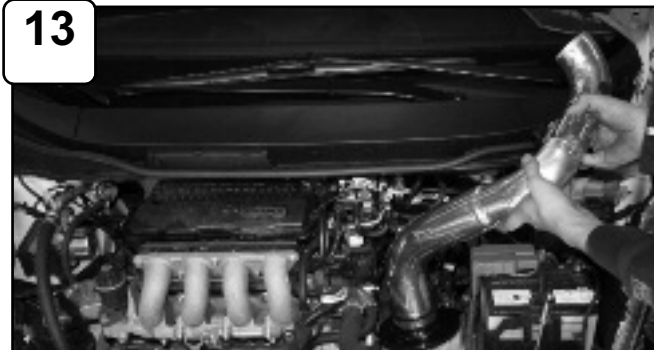
13 Install intake into vehicle.