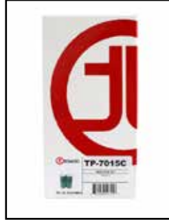
Pro DRY S Restore Kit