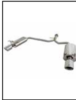
Sedan Axle-Back Exhaust

P/N: 49-36604 (Pol. Tips) 49-36604-B (Blk. Tips) 49-36604-L (Blue Tips)