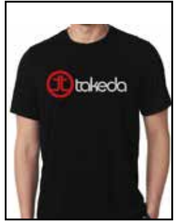
Takeda Mens T-Shirt

P/N: 40-30332 (M) 40-30333 (L) 40-30334 (XL)