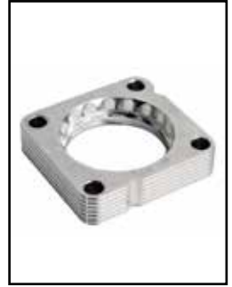
Throttle Body Spacer