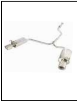
Sedan Exhaust System

P/N: 49-36605 (Pol. Tips) 49-36605-B (Blk. Tips) 49-36605-L (Blue Tips)