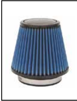
Pro 5R Air Filter