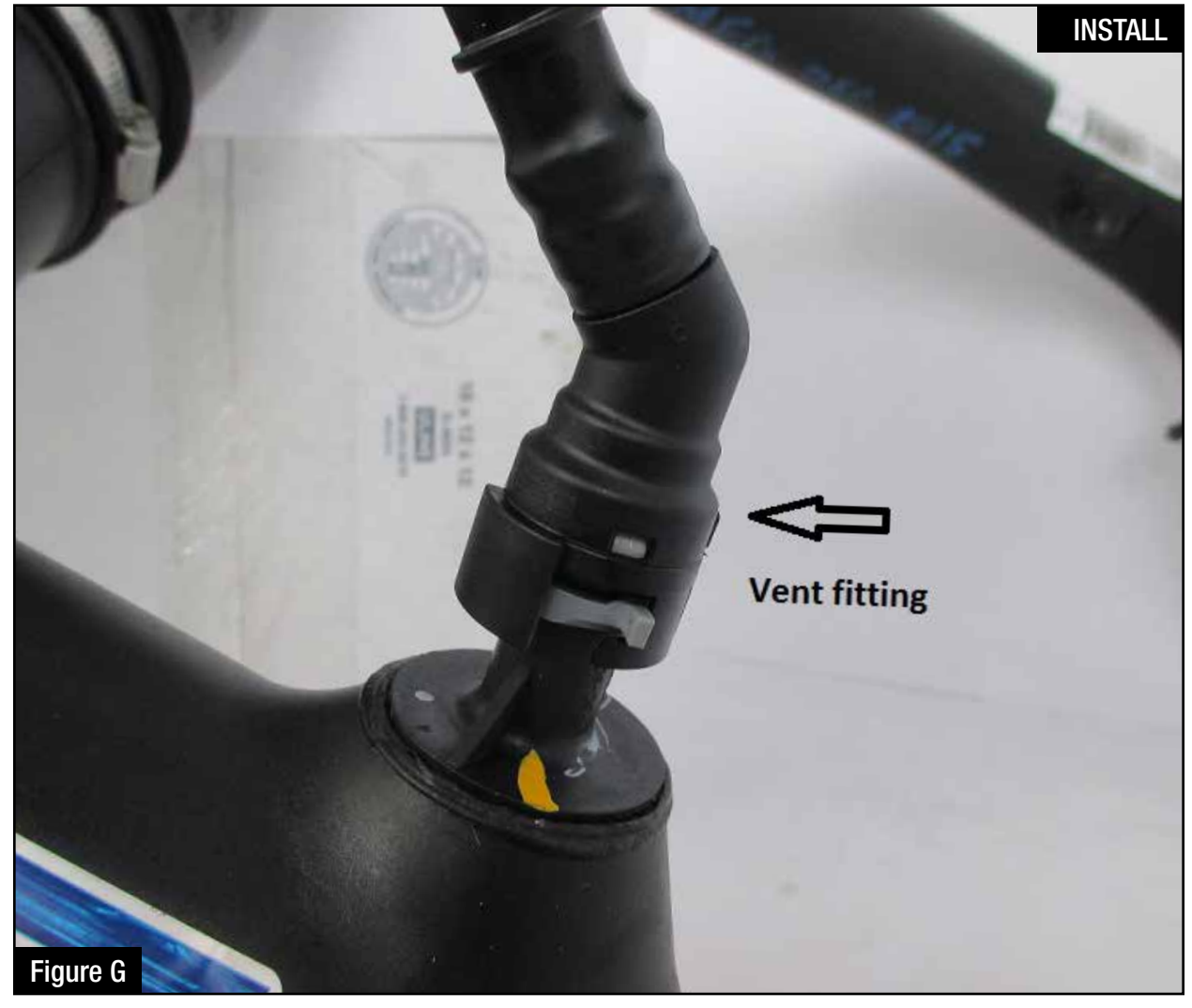
Refer to Figure G for Step 16

Step 16: Locate the valve cover vent tube that feeds into driver's side turbo inlet. It is not necessary to remove the engine cover.