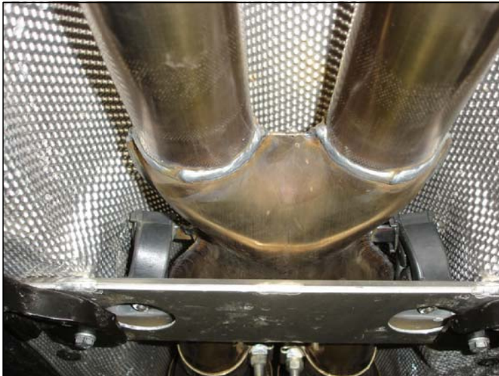
Fig # 2

Step 5: Once a final position has been chosen for the new system, evenly tighten all fasteners from front to rear. The supplied band clamps must be VERY tight to properly align the pipes and prevent leaks (Approximately 40ft-lbs). U-bolt clamps should be tightened to approximately 30-35ft-lbs. Inspect all fasteners after 25-50 miles of operation and retighten if necessary.