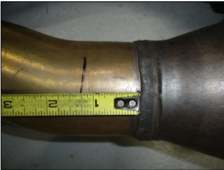
Fig # 1

Warning: When working on, under, or around any vehicle exercise caution. Please allow the vehicle's exhaust system to cool before removal, as exhaust system temperatures may cause severe burns. If working without a lift, always consult vehicle manual for correct lifting specifications. Always wear safety glasses and ensure a safe work area. Serious injury or death could occur if safety measures are not followed.