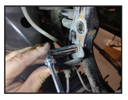
26. Remove the 12mm bolt holding the brake line bracket to the spindle. Secure the supplied adel clamp on top of the bracket with the factory bolt. Make sure the ABS line runs thru the adel clamp. [FIGURE 27 & 28]