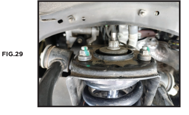
27. Install the new ICON coilover into position. Aligning the 3 studs with the 3 holes in the factory frame mount. Then swinging the lower eyelet into the lower arm pocket. The lower spacers are different lengths. The longer spacer goes towards the rear of the truck. Tighten all nuts and bolts to factory specs. [FIGURE 29 & 30]