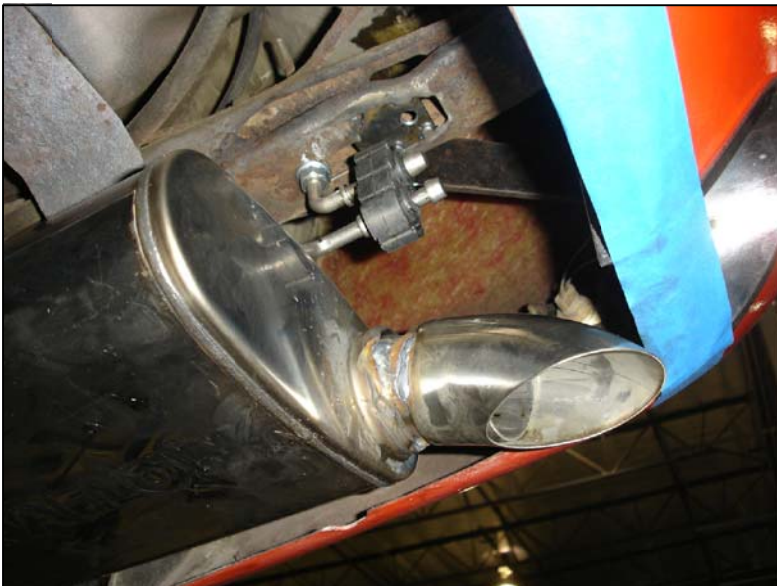
Fig # 2

Step 4: Once a final position has been chosen for the new system, evenly tighten all fasteners from front to rear. The supplied band clamps must be VERY tight to properly align the pipes and prevent leaks (Approximately 40ft-lbs). U-bolt clamps should be tightened to approximately 30-35ft-lbs. Inspect all fasteners after 25-50 miles of operation and retighten if necessary.