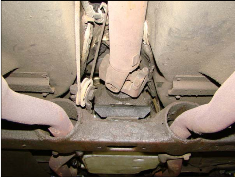
Fig # 1

Step 4: Once a final position has been chosen for the new system, evenly tighten all fasteners from front to rear. The supplied band clamps must be VERY tight to properly align the pipes and prevent leaks (Approximately 40ft-lbs). U-bolt clamps should be tightened to approximately 30-35ft-lbs. Inspect all fasteners after 25-50 miles of operation and retighten if necessary.