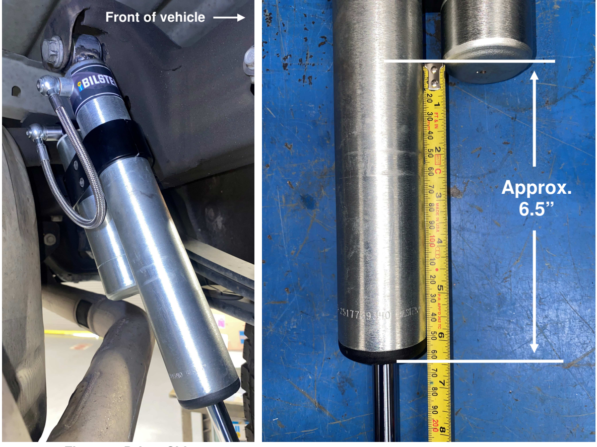
Figure 1. Driver Side