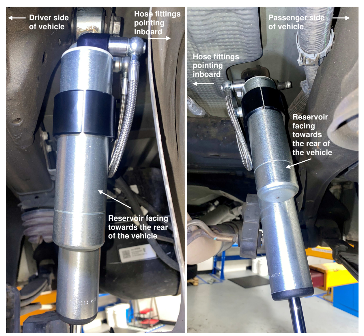
Figure 5. Driver Side (Rear View)