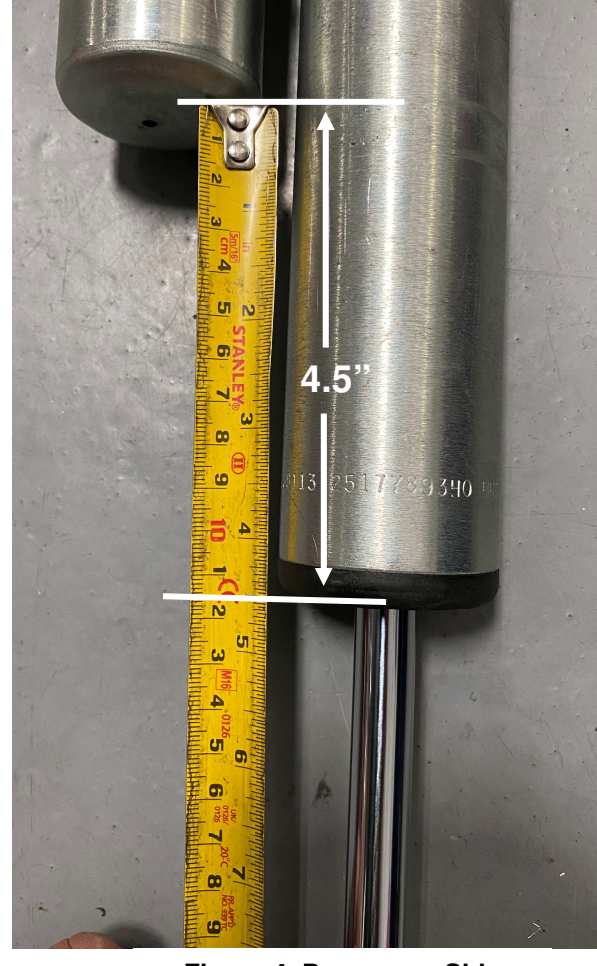
Figure 3. Passenger Side