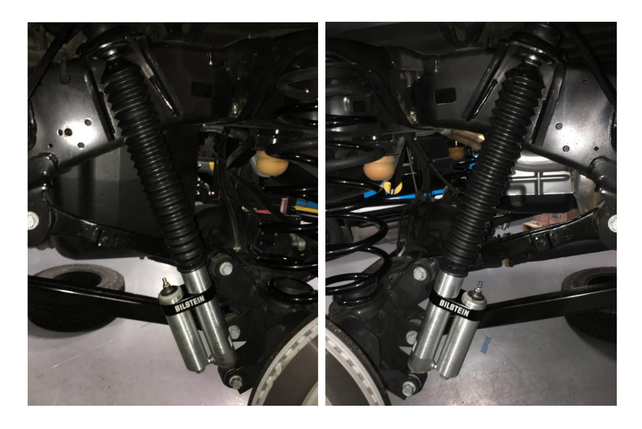
Figure 2 – LEFT REAR