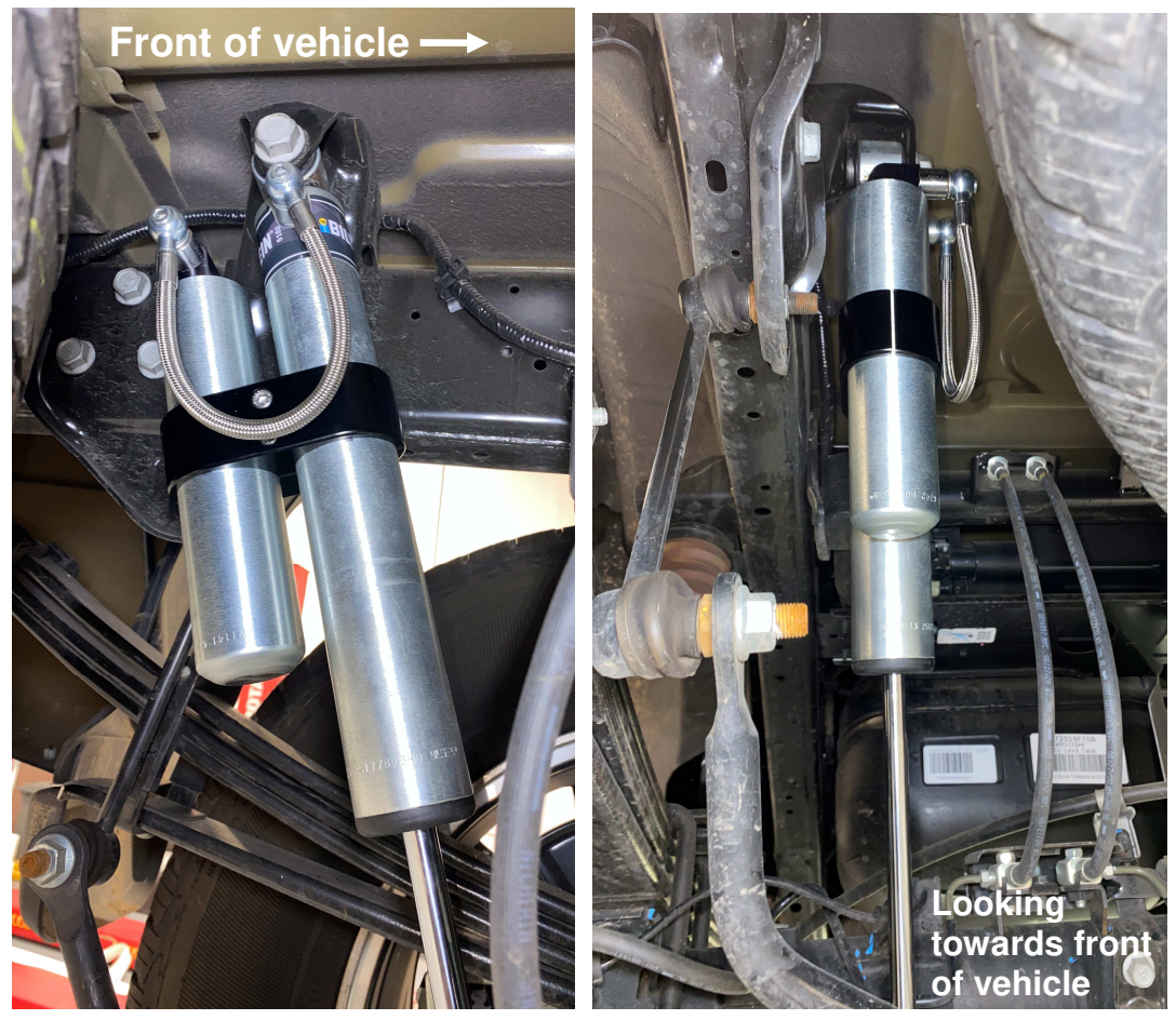
Figure 1. driver side rear