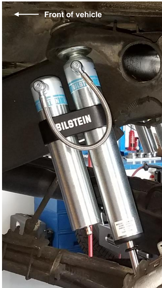
Figure 3. Driver Side