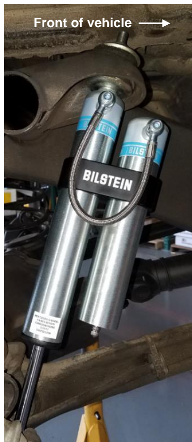
Figure 1. Passenger Side