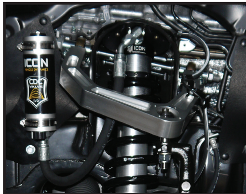
[TECH NOTE #2]

RETORQUE ALL NUTS, BOLTS AND LUGS AFTER 100 MILES AND PERIODICALLY THEREAFTER.