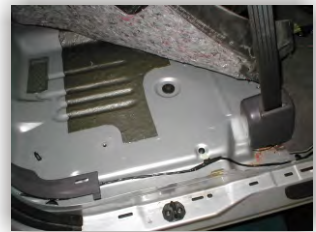
Lift back carpet in extended cab.