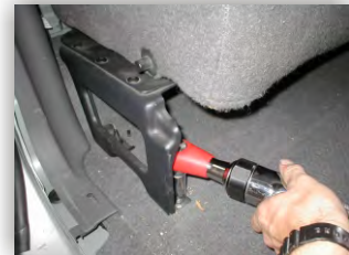
Remove rear seat bolts.