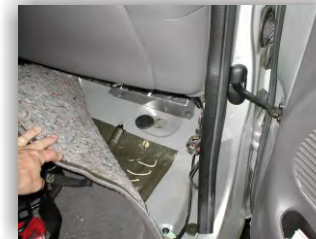
Lift back carpet in passenger area.