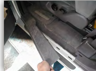
Remove trim panels.