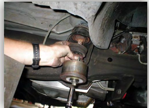
Remove body mounts.

NOTE: If you are having trouble removing the lower body mounts, use a larger washer and a deep sleeve to fit over the lower mount and tighten the factory bolt back into the upper body mount from under the truck. This will act as a puller device to remove the lower body mount. (See picture at right)