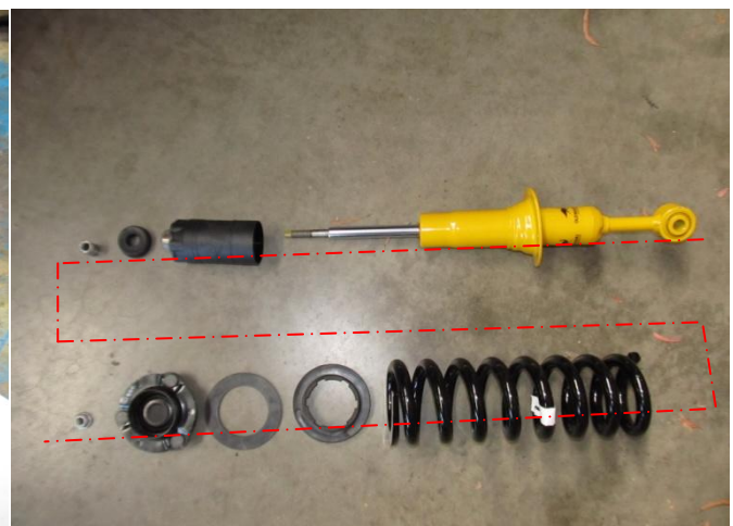
Figure 2: Strut assembly component order