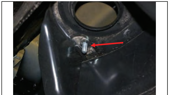
Use provided hardware to fasten new spacer and tighten.