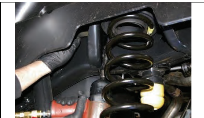
Reinstall OE isolator and coil spring, raise suspension.