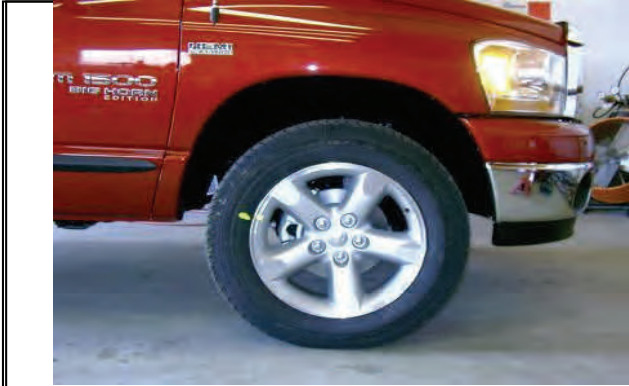
Place vehicle on level ground, properly lift and support.