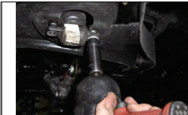
Disconnect lower shock mounting bolts.