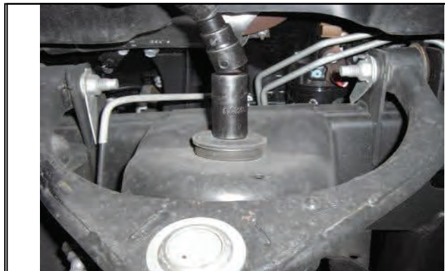
Disconnect upper shock mount and bushing