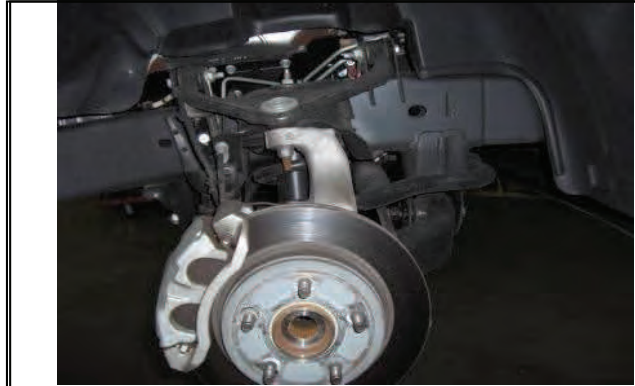
Remove front wheels and tires