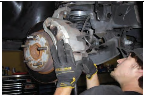
Reconnect brake calipers, sway bar end links, and tie rods.