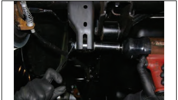
Remove lower shock mounting hardware.