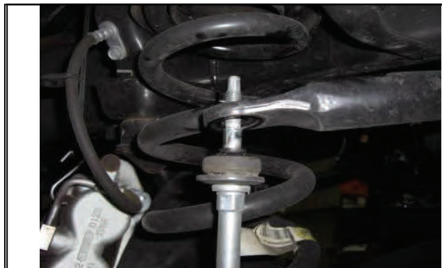
Disconnect upper sway bar end links and bushings