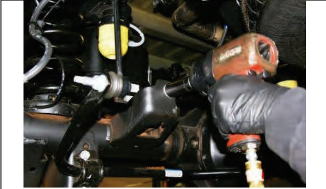
Support rear suspension and remove rear trac bar bolt