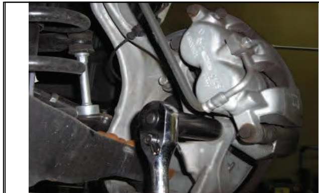
Remove brake calipers