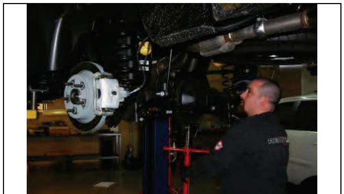
Reattach shocks, trac bar, sway bar end links, and ABS lines