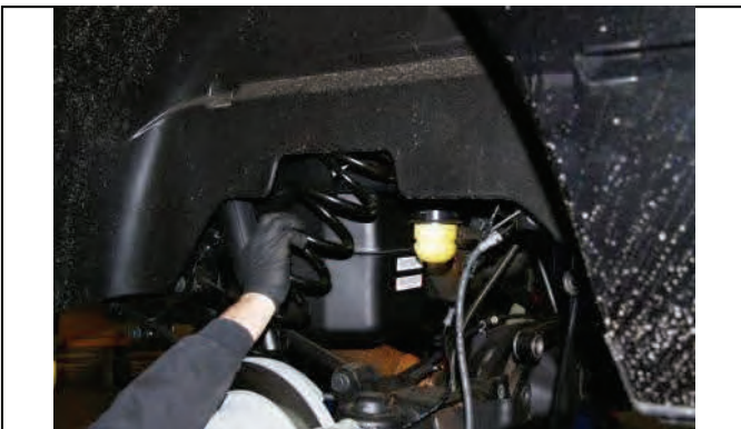
Carefully lower axle, remove spring and upper rubber isolator