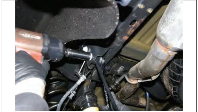
Disconnect upper sway bar end links.