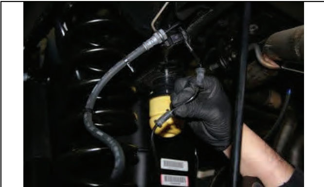
Disconnect ABS lines to avoid damage during installation.