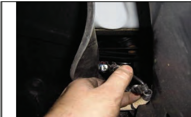
Disconnect ABS line at or behind fender liner.