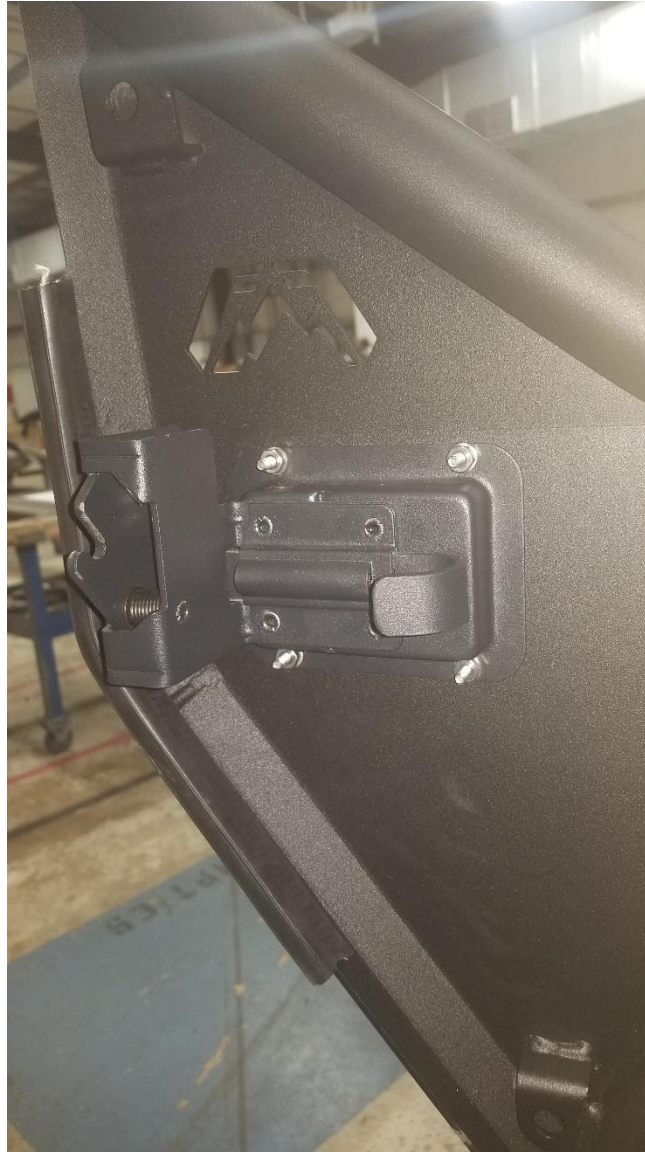
Figure1: rear door latch orientation