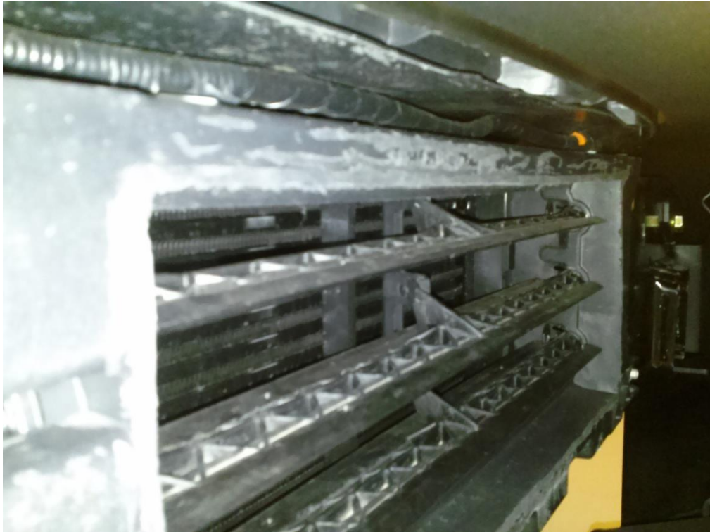
Figure 4 (Louver w/ shroud cut away at base)

be taken not to damage louvers when cutting around the base of the rectangular shroud, a cut off wheel is recommended.