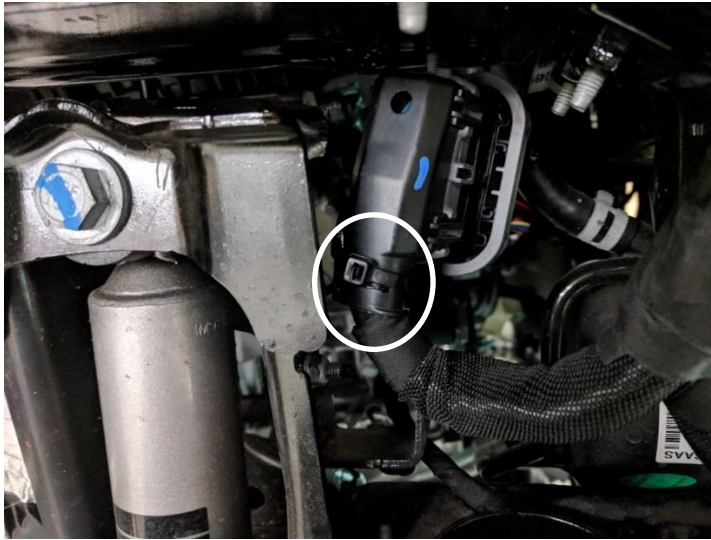
Figure 4 (Passenger side shown)