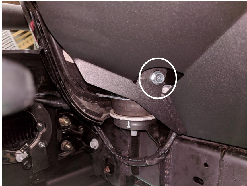
Figure 7 (Driver side shown)