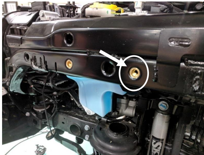
Figure 2 (Driver side shown)