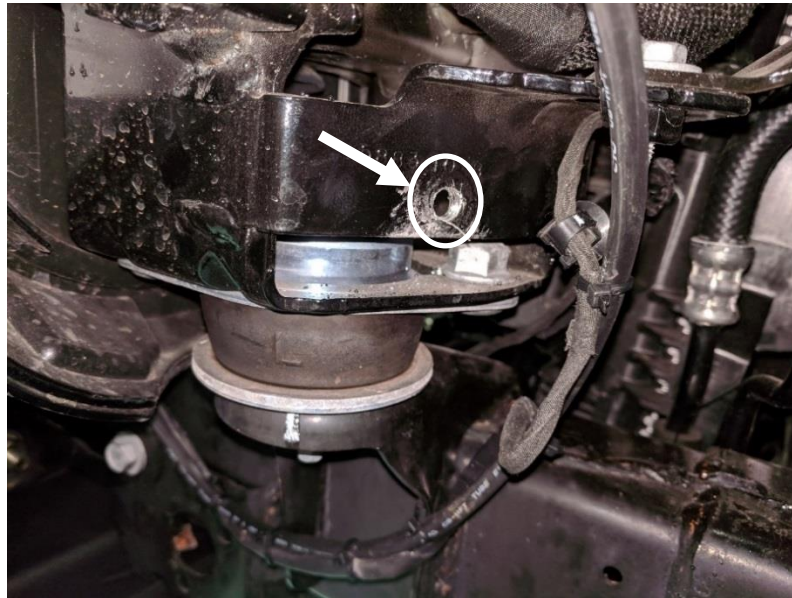
Figure 1 (Driver side shown)