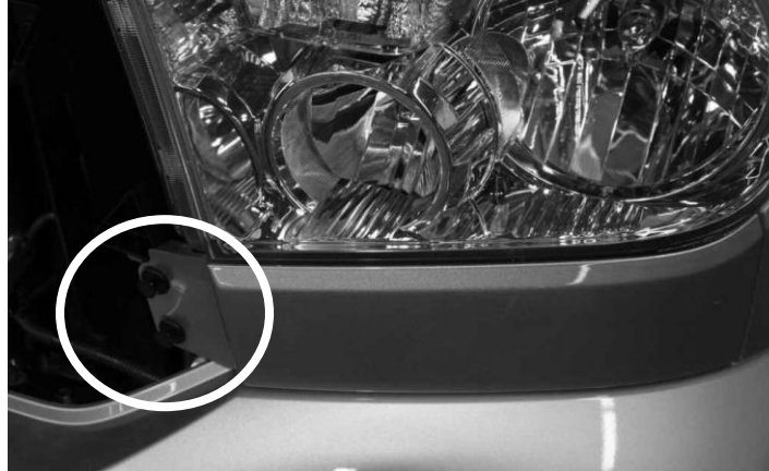
Figure 1 - Fascia Mount Screws