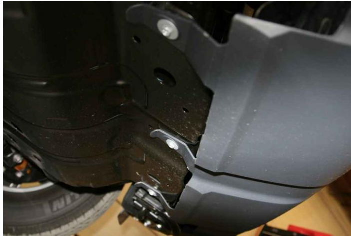
Figure 2 – LOWER BUMPER PLASTIC REMOVAL