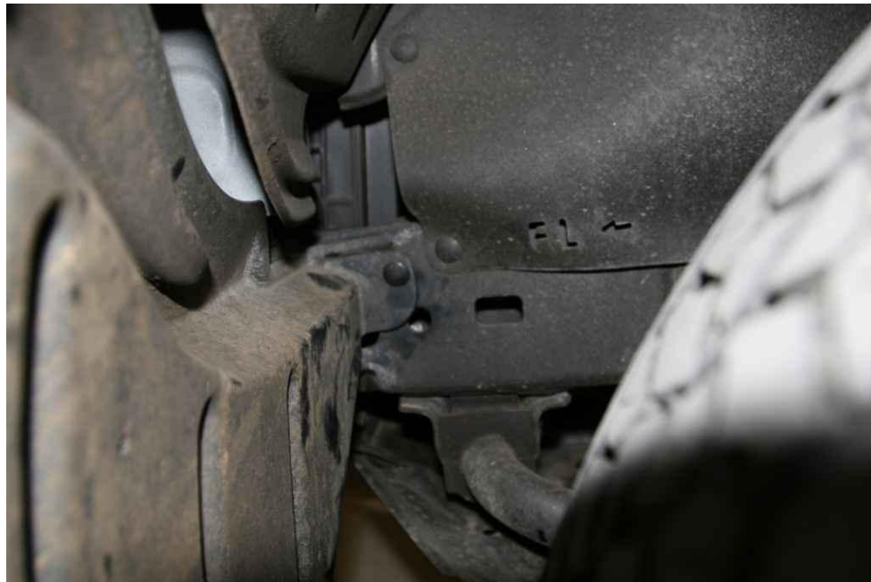
Figure 1 – FENDER LINER DART CLIP REMOVAL