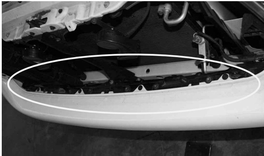
Figure 2 - Center Fascia Fasteners