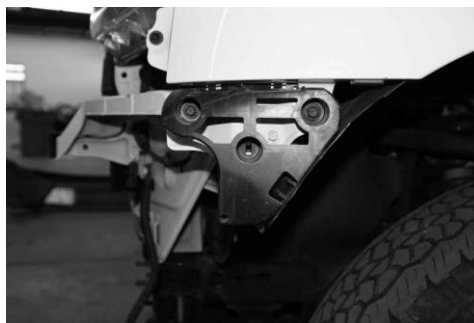
Figure 4 - Spacer Fastener Locations