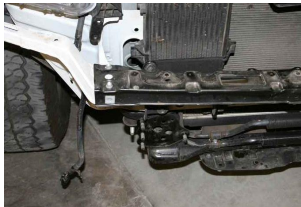
Figure 3 – BUMPER TO FRAME FASTENER REMOVAL