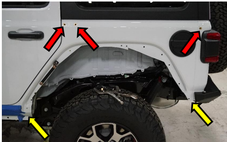
Figure 8. All rivet nuts installed and holes drilled. Red arrows indicate holes to drill out to \frac{17}{32} "; yellow arrows indicate holes to drill out to \frac{3}{8} ".

8. With all the holes drilled out to \frac{17}{32} " you can now begin installing rivet nuts with the provided rivet nut tool.