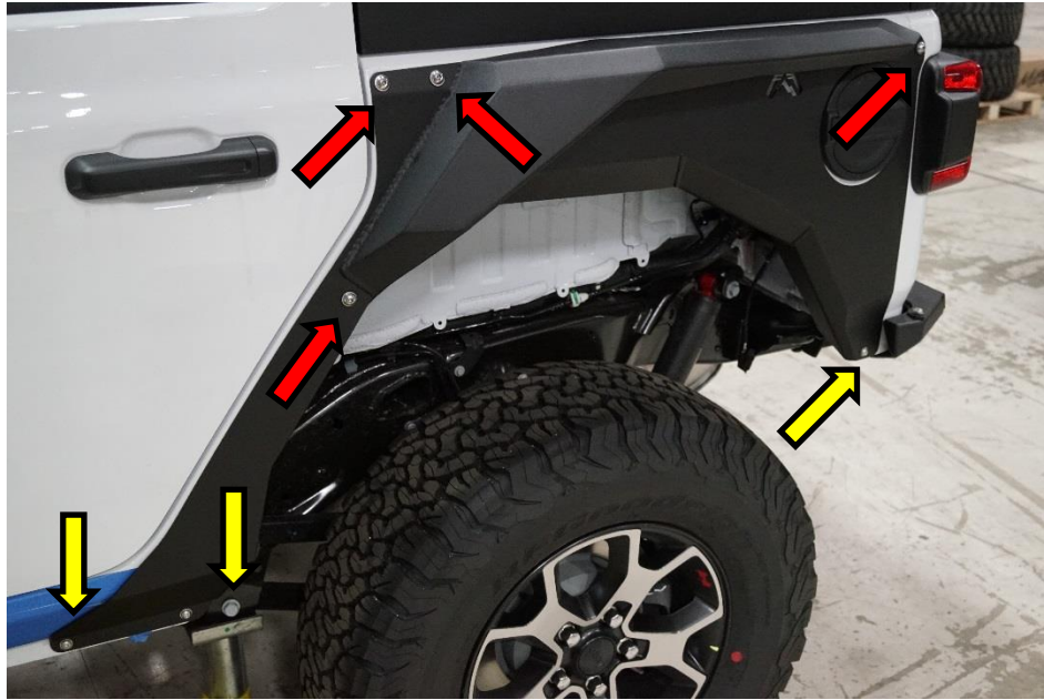
Figure 9. Locations for 3/8" SS hardware (red arrows) and 5/16" SS hardware (yellow arrows).

Repeat steps 1 through 10 to install other side.