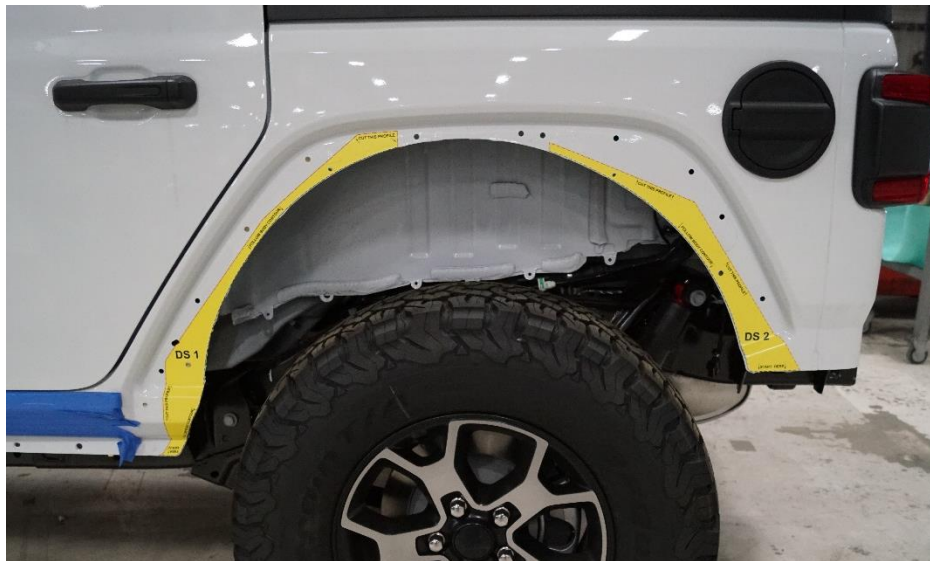
Figure 3. Template placement for DS 1 and DS 2