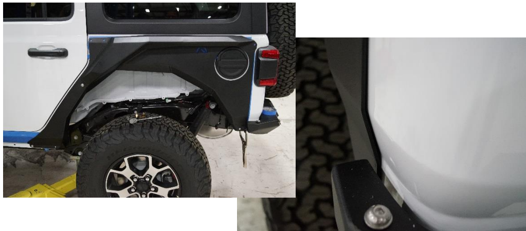
Figure 6a & 6b. Initial placement of fender for marking mounting points correctly.

5. Orient the rear of the fender to cradle the contours on the lower portion of the Jeep (see figures 6a & 6b) to correctly position the fender. Clamp at the lower back end when satisfied with the fender position.