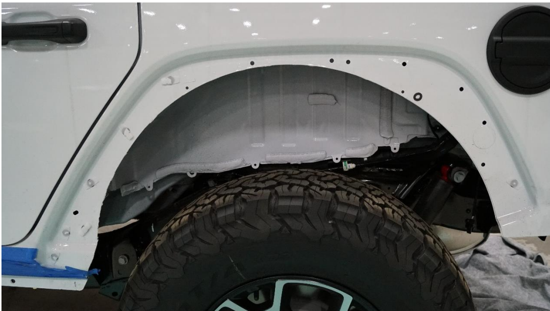
Figure 2. Remove white plastic clips that were left behind by OEM flare removal.

Repeat steps 1 through 3 for passenger side.