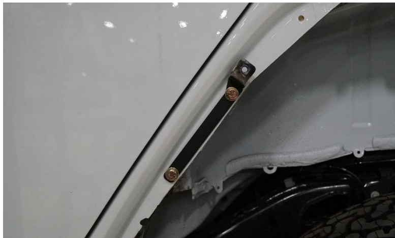
Figure 5. Body bracket installed with YZ hardware.