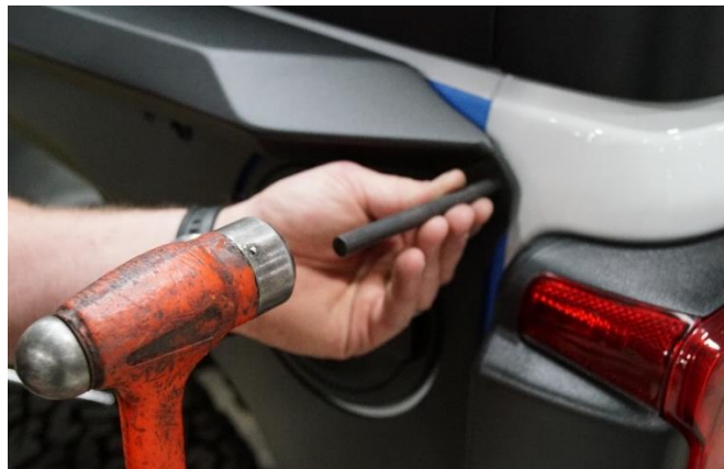
Figure 7. Marking hole locations with transfer punch.

6. With fender base held in place, using a transfer punch, mark the center of the mounting holes. Once holes are marked, remove fender base.