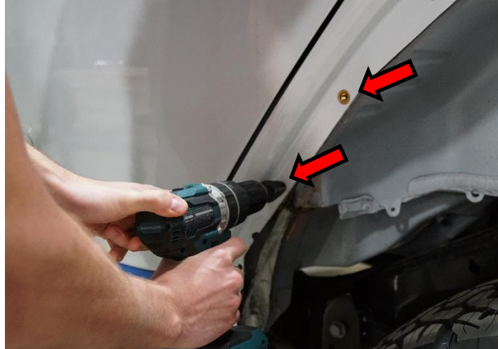
Figure 4. Drilling OEM holes wider to accommodate rivet nuts.