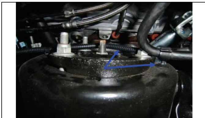
Upper coil over mount, remove clip and note wiring route.