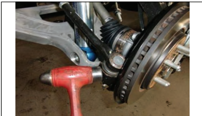
Carefully strike spindle to separate tie rod, remove nut.