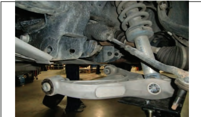
Position lower strut mount into LCA and reattach lower bolt