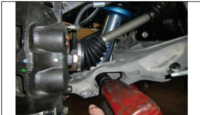
Remove lower coil over mounting hardware.