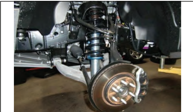
View of front suspension.