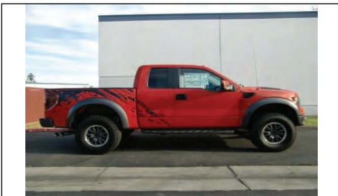
Reinstall wheels/tires lower to ground, test drive, align