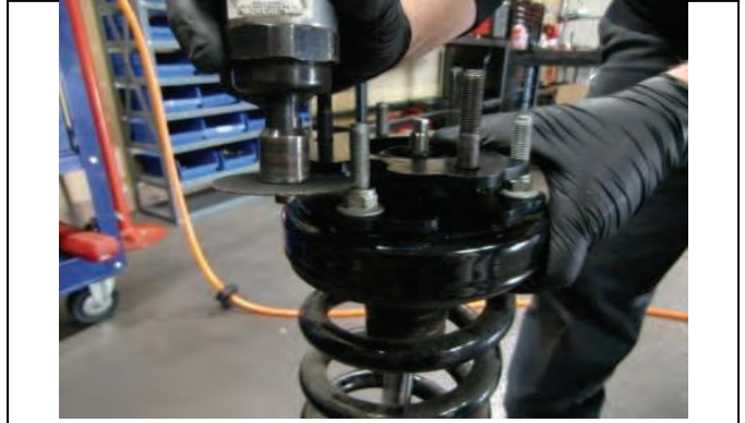
Once tightened cut OE studs flush with top of new spacer.