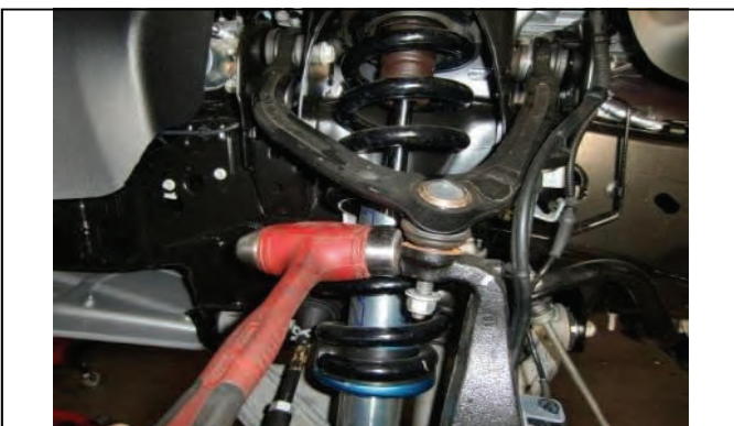
Carefully strike spindle as shown to separate ball joint