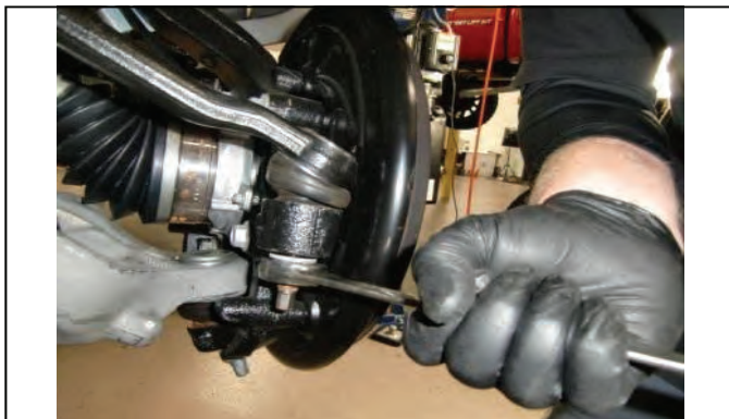
Loosen outer tie rod nut and leave connected.