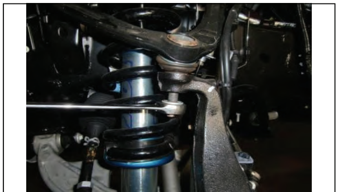
Loosen upper ball joint and leave connected.