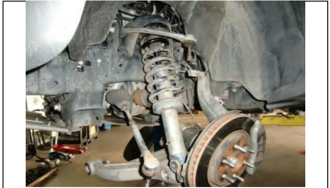
Support suspension and remove lower control arm bolts