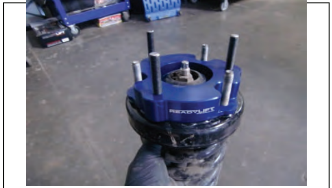
Place spacer on top of strut assembly