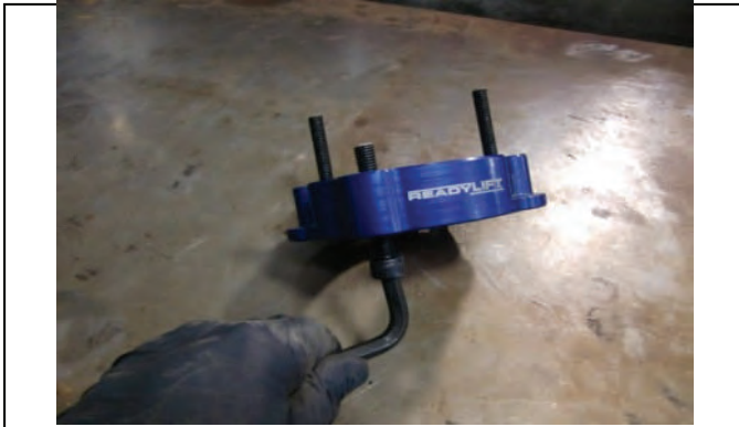
Shown T6-2055 , screw bolts into spacer and torque