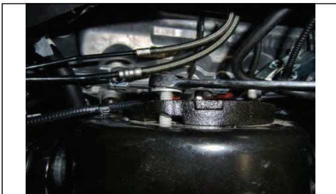
Remove mounting nuts and note, cast spacer orientation.