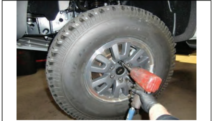
Remove front wheels.