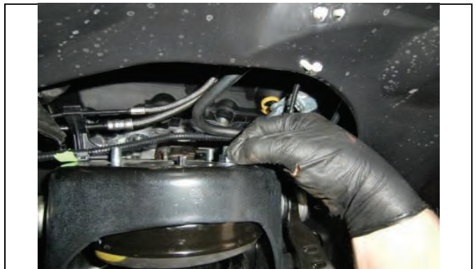
Bolt strut assembly into original position with new hardware