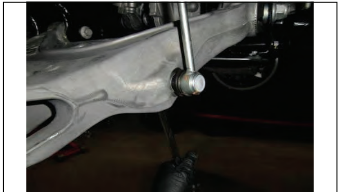
Disconnect lower sway bar end link at lower control arm.