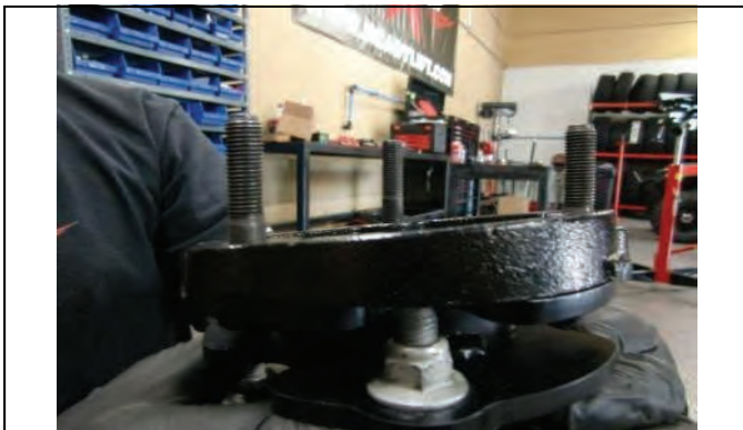
Reinstall cast spacer in original position