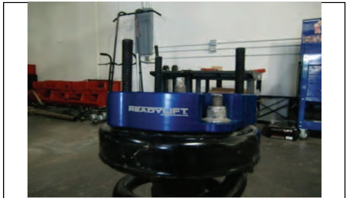
Install spacer on top of strut using OE hardware