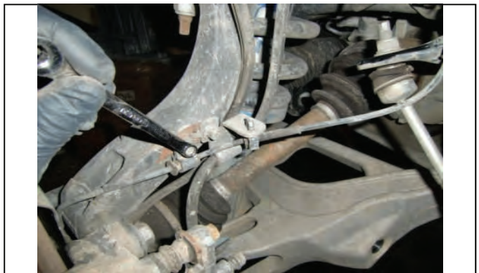
Reconnect ABS wiring, sway bar end link and outer tie rod