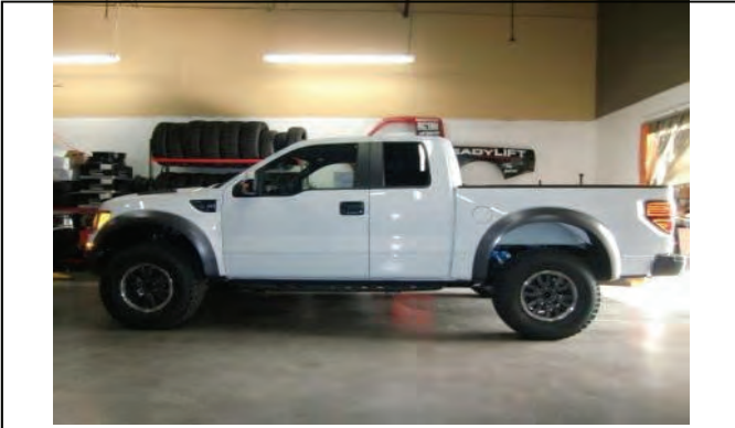
Raise and support front of vehicle on level ground.