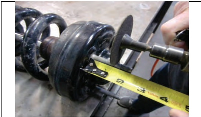
Measure and cut off OE studs flush with top of spacer