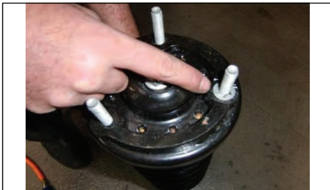
Remove coil-over, note retaining clip and remove spacer