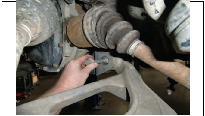
Raise LCA into frame and reattach with OE bolts