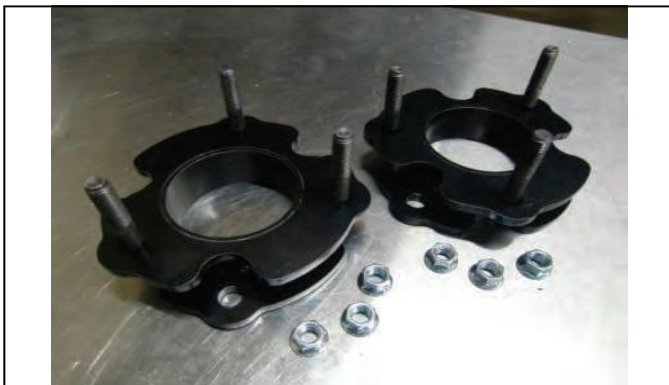
Shown, 66-2055 upper strut extension kit.