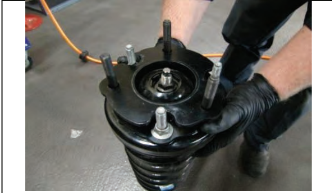
Remove cast spacer and mount new spacer w/OE nuts.