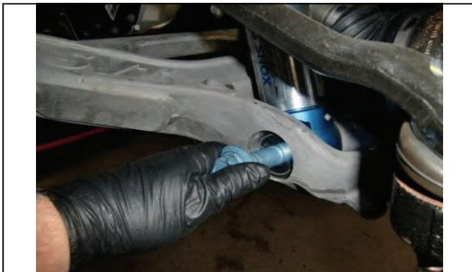
Gently tap bolt and remove lower bolt.