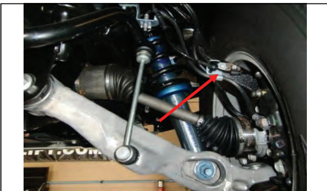
Disconnect ABS/vacuum line brackets on spindle/upper arm.