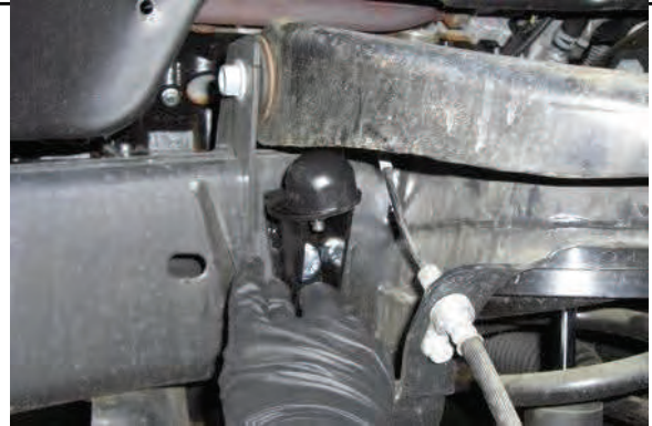
Note: pass/dr side brackets are specific. Tighten once aligned