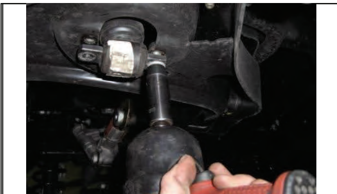
Disconnect lower shock mounting bolts.