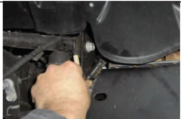
Reconnect ABS lines.

Torque all hardware to factory spec and recheck to ensure there is proper clearance and slack for ABS lines to travel through entire suspension range. Reinstall and torque wheels and tires, test drive and have vehicle aligned.