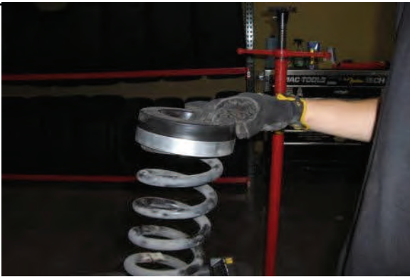
Remove upper isolator and replace with new ReadyLIFT hat.