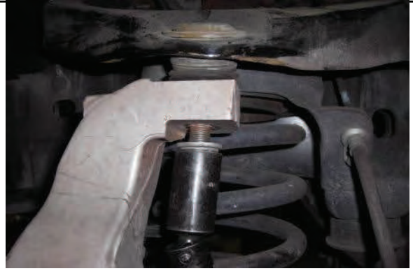
Loosen upper ball joint nut and break loose with hammer.

Break loose tie rod/upper ball joint No photo