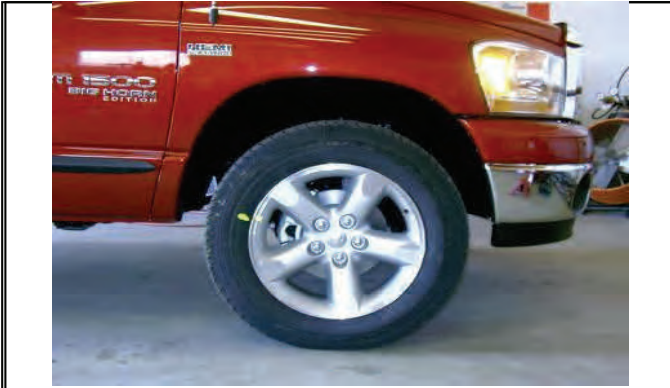
Place vehicle on level ground, properly lift and support.