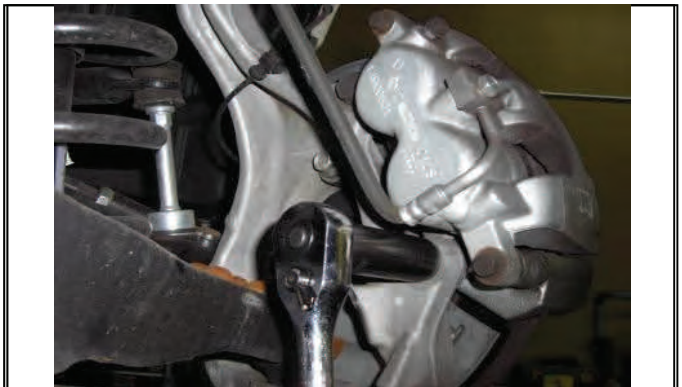
Remove brake calipers