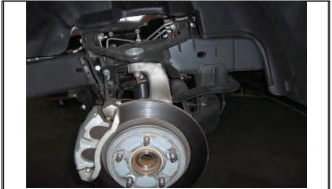
Remove front wheels and tires