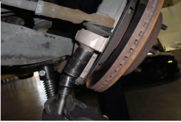
Disconnect tie rod end nut and break loose with hammer