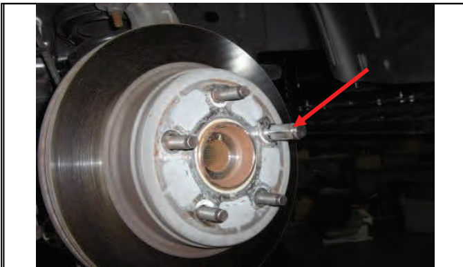
Place a lug nut back onto any wheel stud as shown