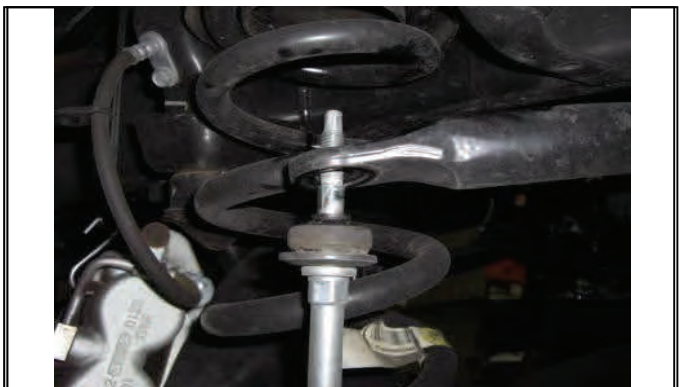
Disconnect upper sway bar end links and bushings