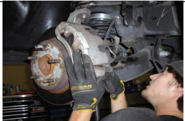
Reconnect brake calipers, sway bar end links, and tie rods.