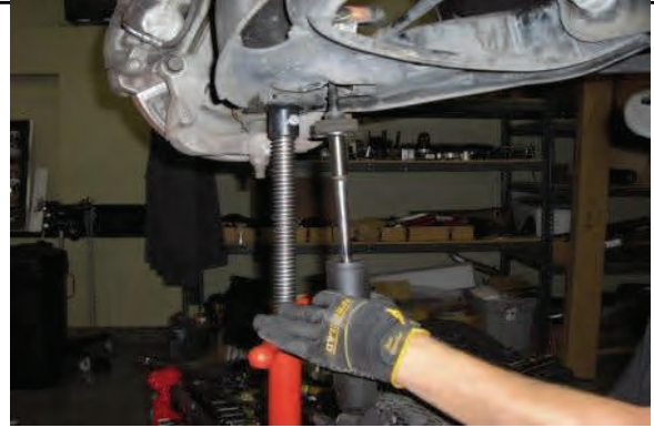
Reuse OE bushings and hardware top and bottom.