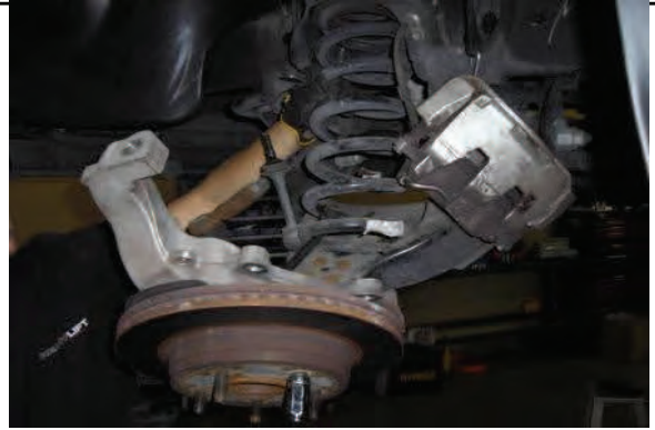
Slowly lower suspension and remove coil spring.