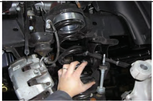
Reinstall coil spring and properly clock in lower control arm.