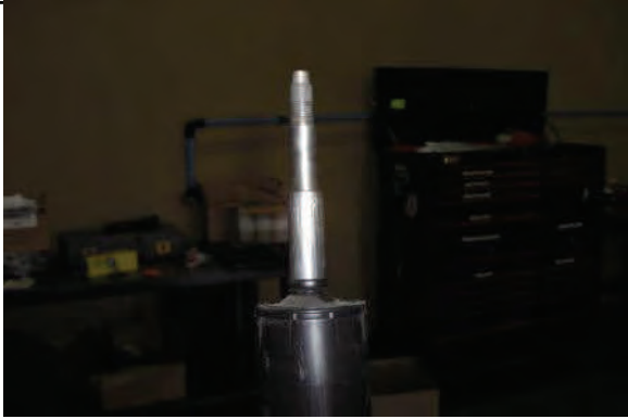
Install and tighten new upper shock extension