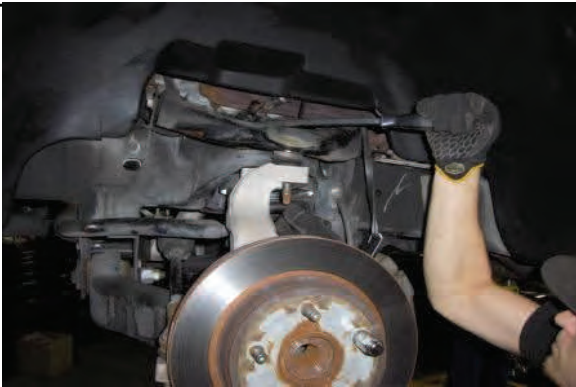
Carefully lift suspension enough to engage upper ball joint.