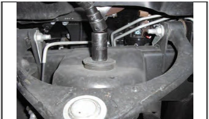
Disconnect upper shock mount and bushing