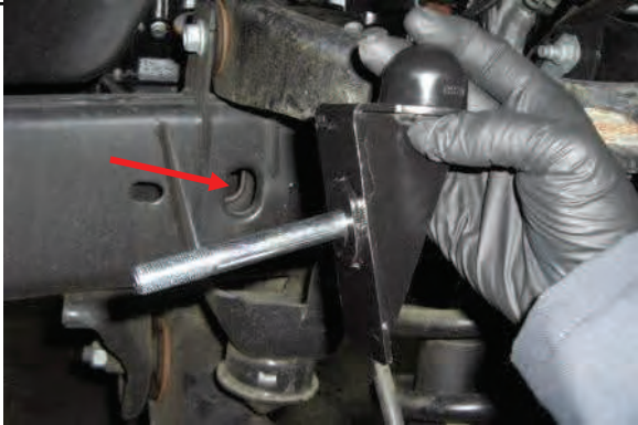
Attach new bump stop and bracket to frame as pictured