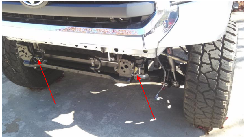
Figure 3 - Factory Bumper Connection