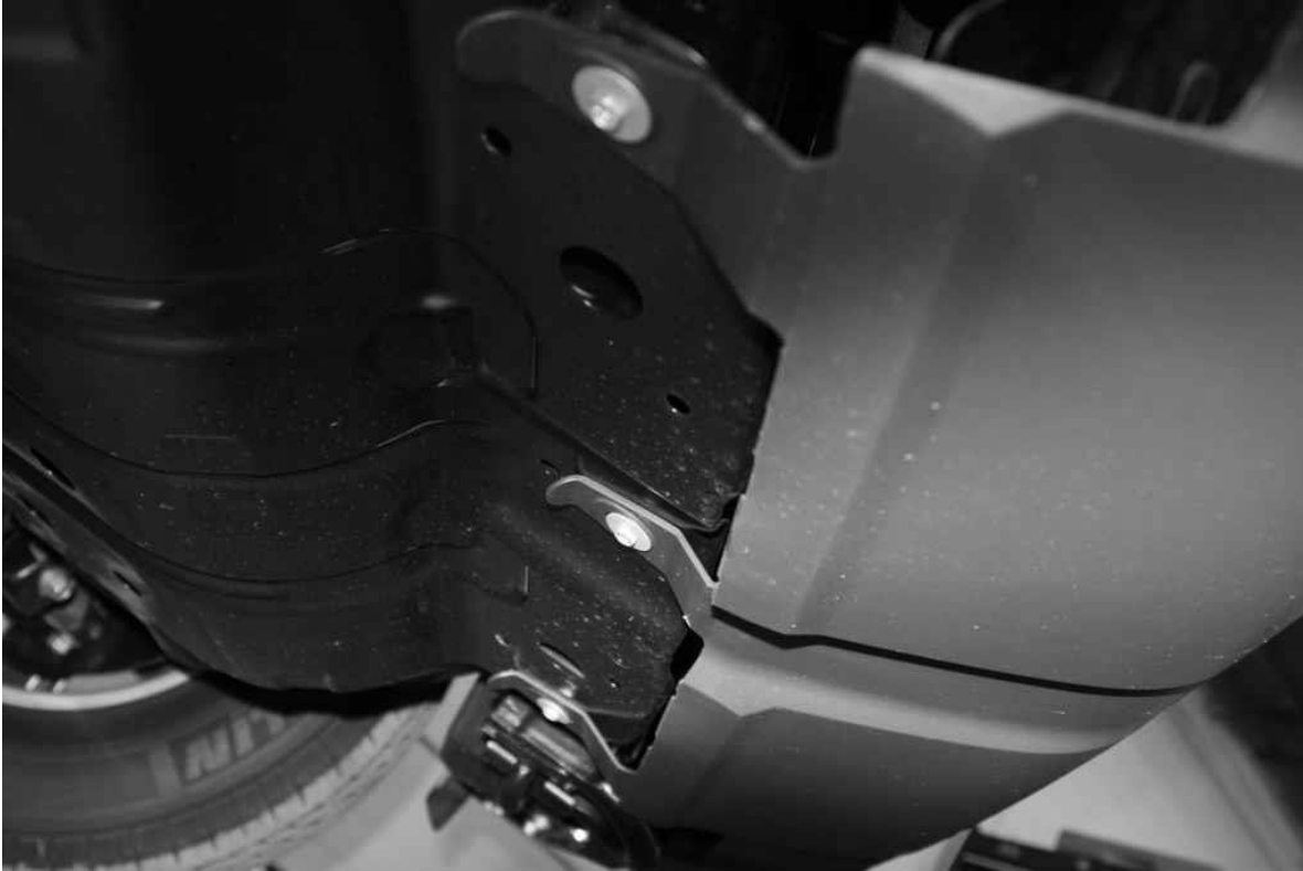
Figure 2 - Screw Locations