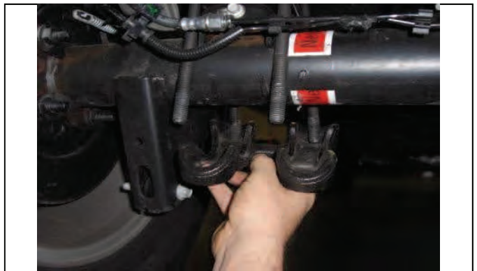
Remove lower u-bolt axle plate.