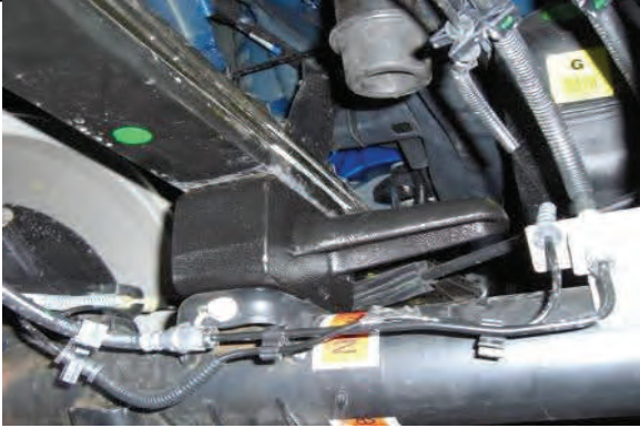
Raise axle and center on locating pins in leaf spring.