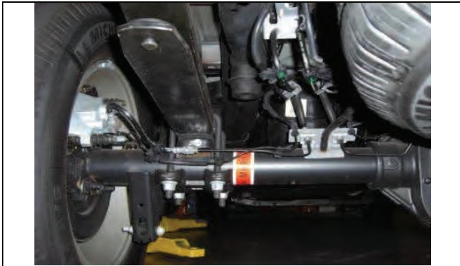
View of 2WD rear axle and leaf springs.