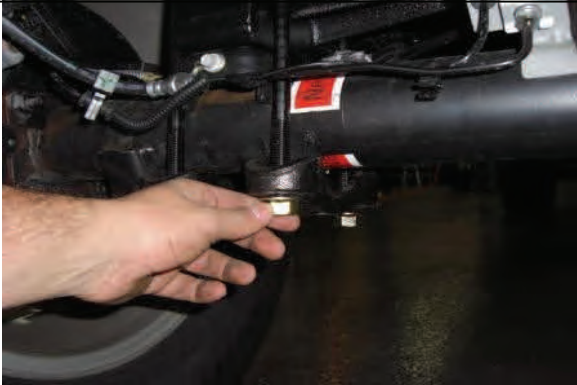
Place lower spring plate onto u-bolts and attach w/ new nuts.