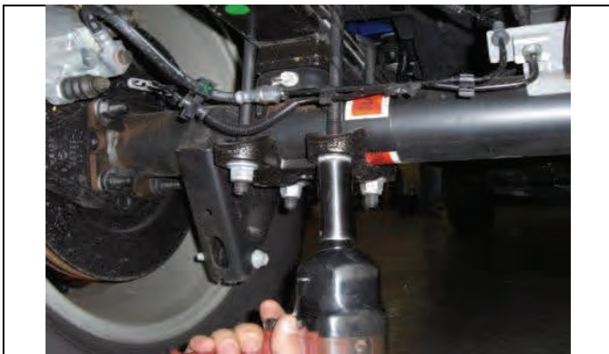
Loosen and remove factory u-bolt hardware.