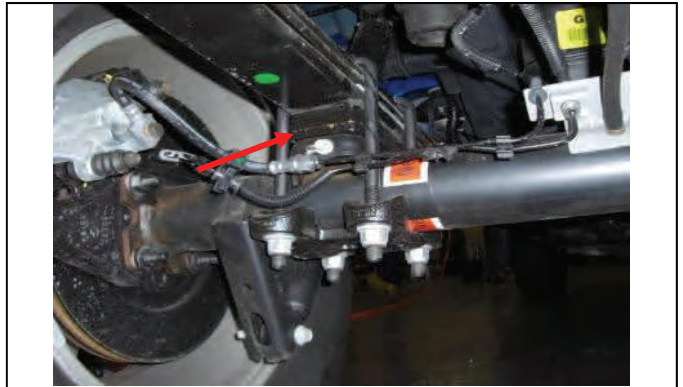
View of 4WD rear axle and leaf spring, note factory block