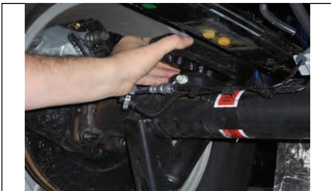
4WD only: Lower axle enough to remove factory block.