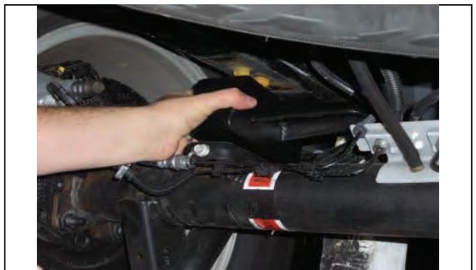
Install lift block with centering pin toward axle.