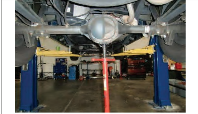
Raise vehicle at frame and support axle with jack