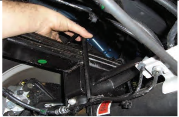
Place new longer u-bolts over leaf spring and axle.