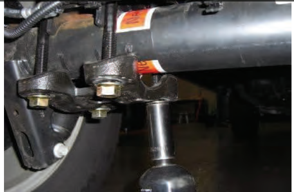
Snug hardware down, lower vehicle on ground and torque.

Recheck all work and test drive. Vehicles with two piece drive shafts may require lowering of the carrier bearing with spacers.