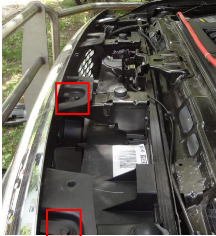
Figure 2a-bolts on LH side

B. Remove the fasteners connecting the grill to the frame with a 10mm socket. Four bolts are located at the top of the grill, two on each side (Ref. Figure 2a-b). There are multiple clips holding the grill to the vehicle.