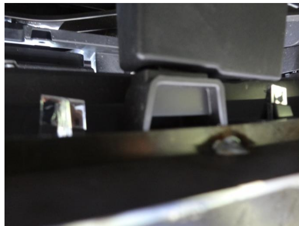
Figure 2c- example of clip holding grill