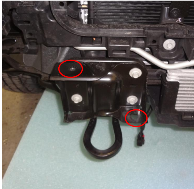
Figure 3a (TOW HOOK & OEM MOUNTING BRACKET)