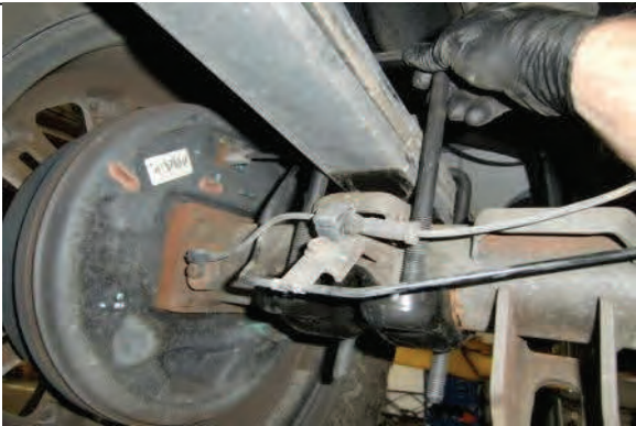
Remove u-bolts and axle mounting plate