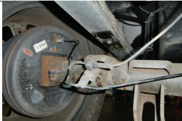
Carefully lower axle enough to install new block