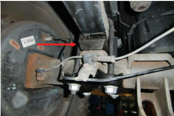
4WD models shows factory block