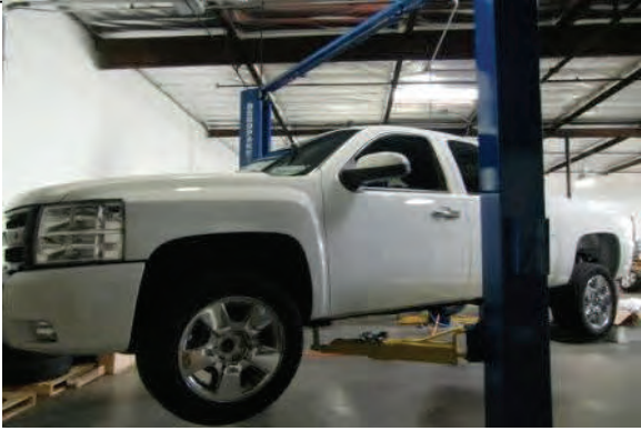
Raise and support vehicle by frame on jack stands