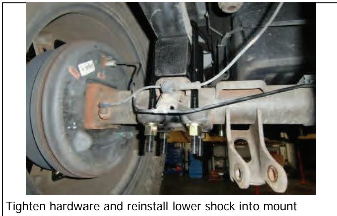
Tighten hardware and reinstall lower shock into mount

Recheck all work performed, torque hardware and lower vehicle to ground and test drive.