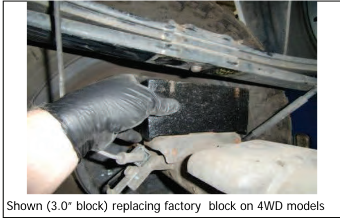
Shown (3.0" block) replacing factory block on 4WD models