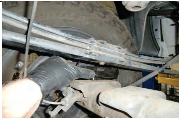
4WD models lower axle and remove factory block