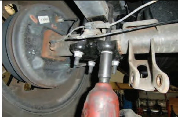
Remove u-bolt mounting hardware