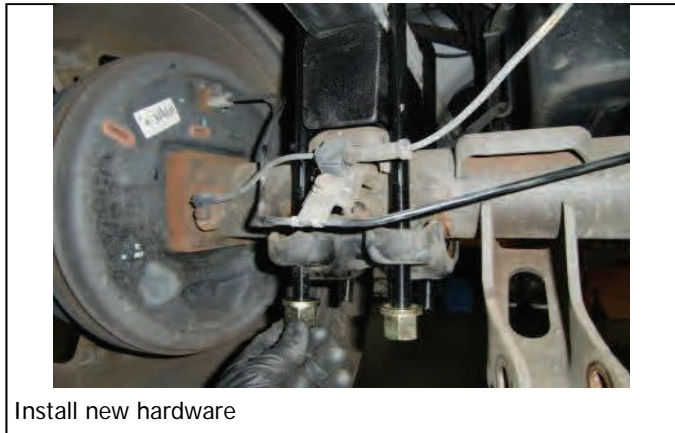
Install new hardware