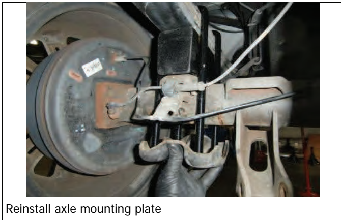
Reinstall axle mounting plate