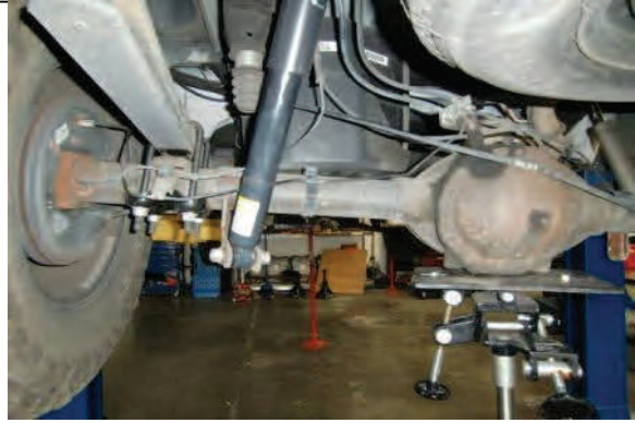
Support rear axle with jack