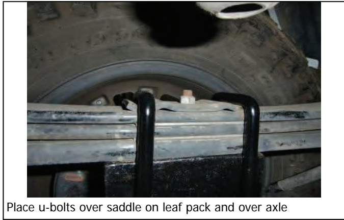
Place u-bolts over saddle on leaf pack and over axle