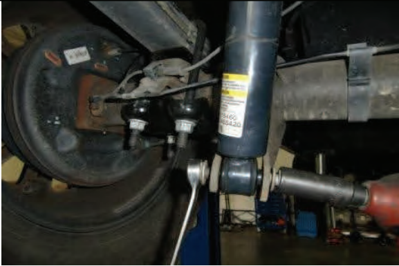
Disconnect lower shock from mount