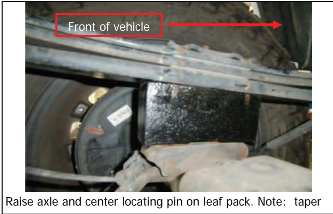
Raise axle and center locating pin on leaf pack. Note: taper