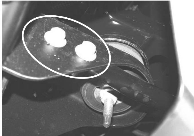
Figure 4 – Outer Bumper Support Screws