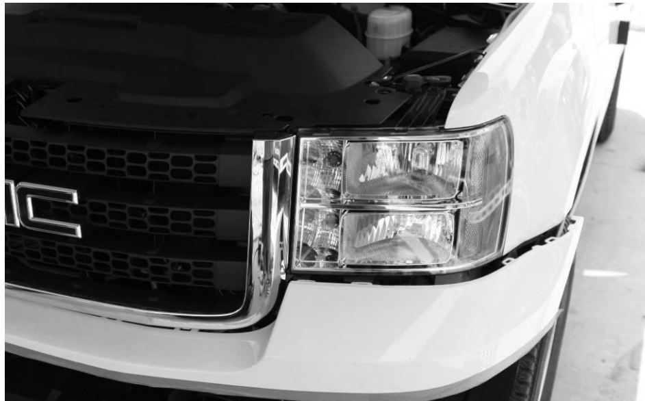
Figure 3 - Valance Removal