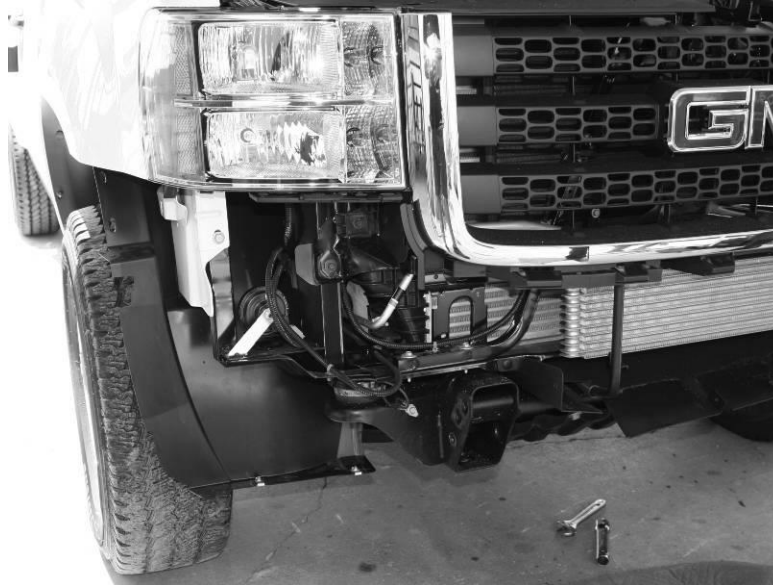
Figure 7 - Disassembly Complete