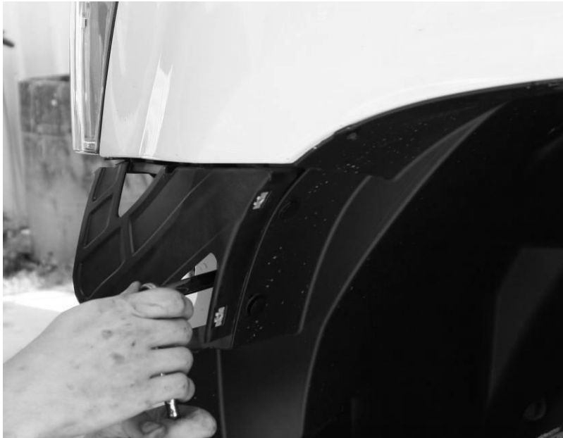
Figure 6 - Support Bracket Removal