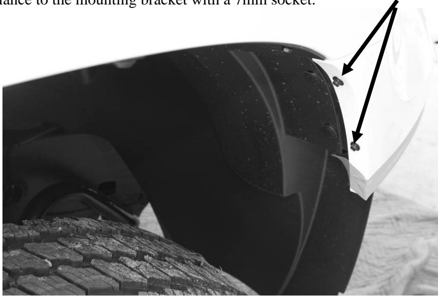
Figure 2 - Screw locations