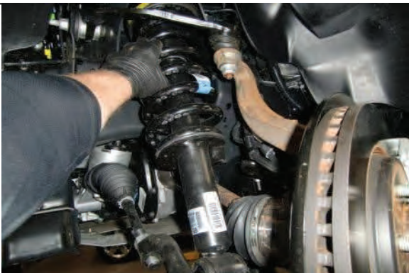
Remove strut assembly from vehicle