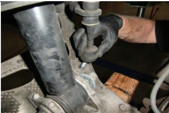
Reconnect lower sway bar endlinks and torque to spec.