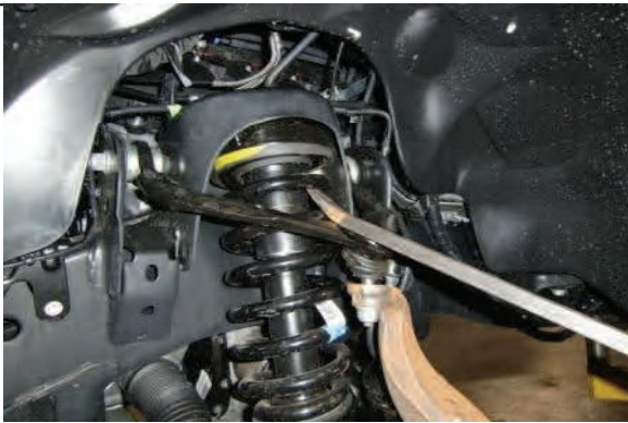
Use jack and pry bar to reattach upper ball joint to spindle.