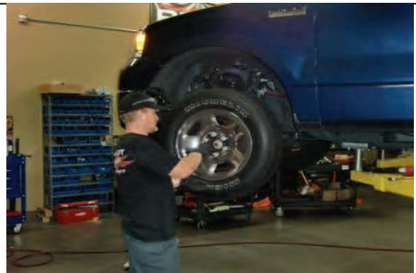
Install wheels/tires torque to spec., measure and align