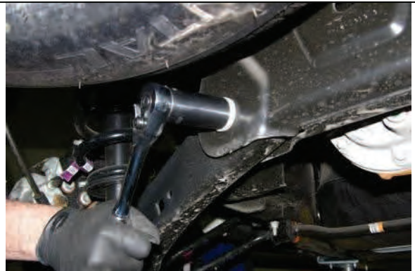
Remove inner lower control arm hardware.