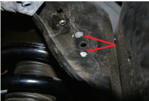
Use 3/16 drill and reuse OE mounting bolt to reattach.

Next, reinstall wheels/tires lower to ground and torque. Then tighten lower strut mounting hardware and inner lower control arm hardware to spec. as shown in the next step.