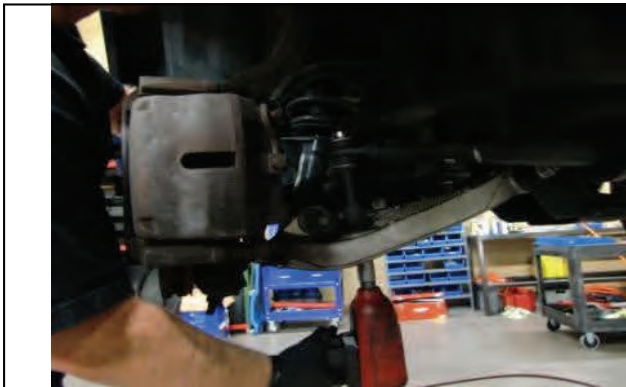
Remove lower sway bar endlink hardware.