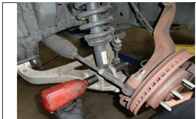
Loosen lower strut bolt/nut and remove.