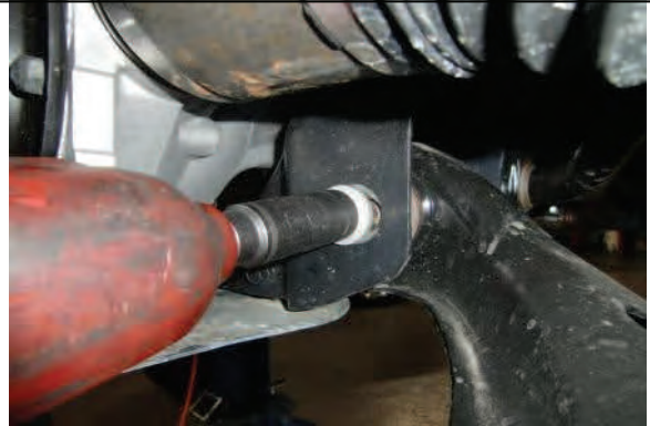
Loosen and remove rear lower control arm bolt and nut.