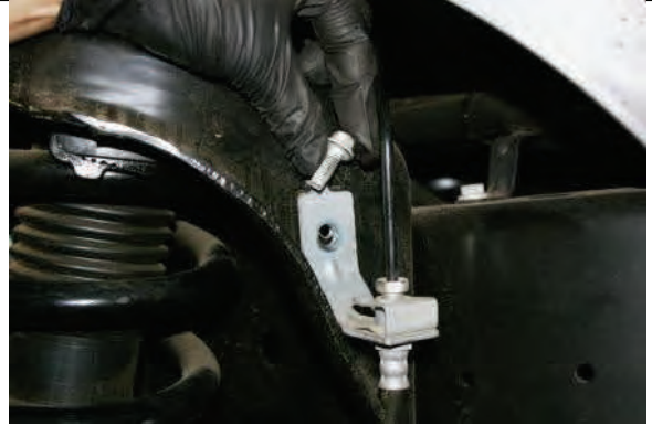
Unbolt brake line bracket from coil bucket.