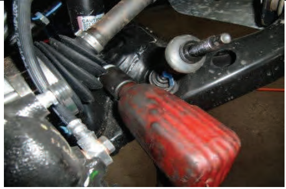
Disconnect and remove lower shock bolt and nut.