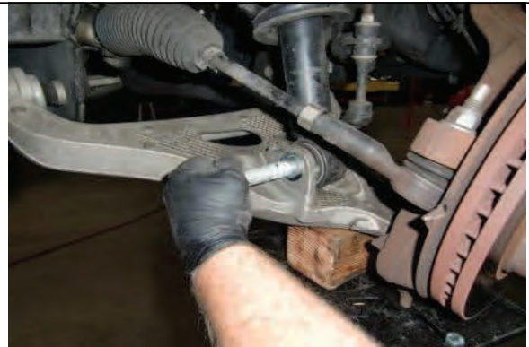
Reconnect lower strut mount and torque to spec.