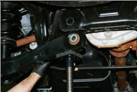
Use jack to raise lower control arm and connect with OE bolt.