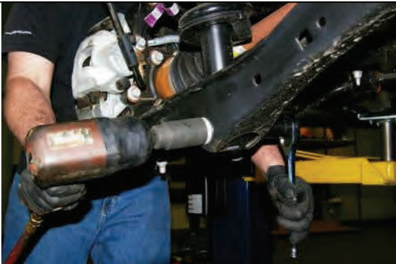
Remove lower strut mounting hardware.