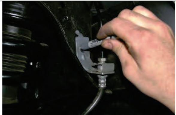
Mark and drill new brake line bracket holes 1-1.25" lower.