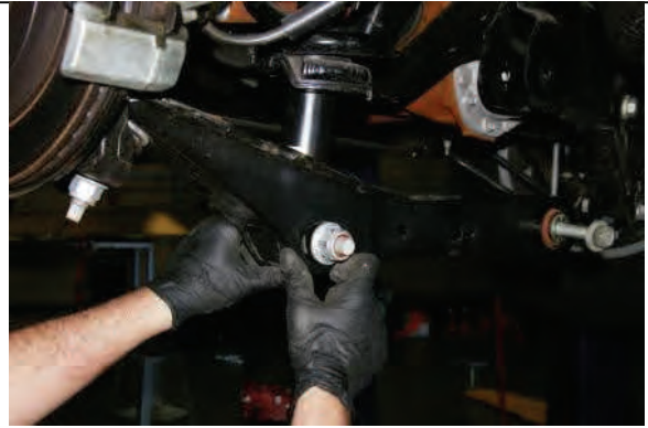
Reinstall lower strut mounting bolt. Tighten later.