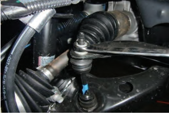
Disconnect upper sway bar end links.