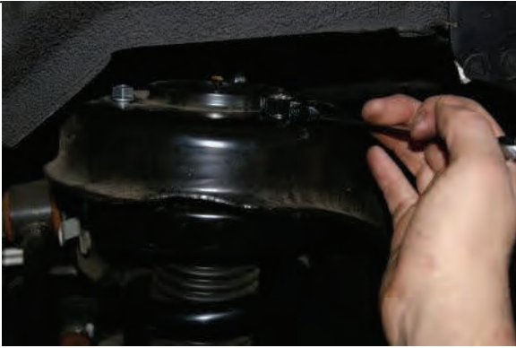
Tighten upper strut mounting hardware