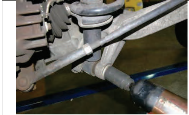
Remove lower strut mounting hardware.