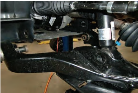
With jack, lower control arm from frame pockets.