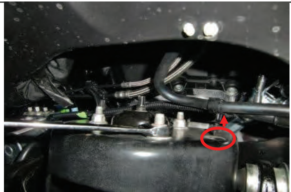
Pry ABS line clip out and remove upper strut mounting nuts.