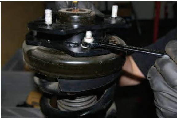
Attach upper strut extension with OE hardware.