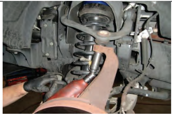
Tighten upper ball joint and torque to spec.