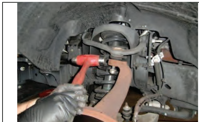
Carefully strike spindle as shown to separate ball joint.