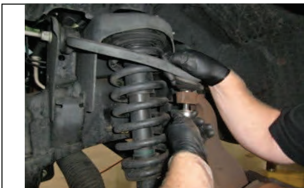
Pull down and remove upper ball joint nut.