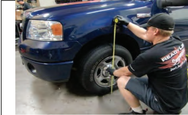
Place vehicle on level ground and measure.