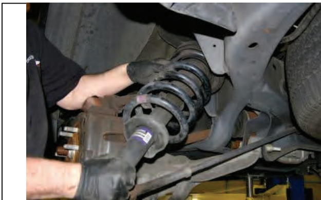
Remove strut assembly from vehicle