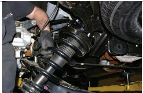
Reinstall strut assembly in vehicle with new nuts.