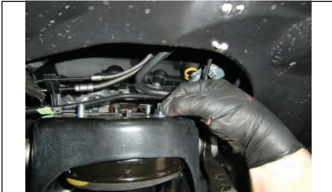
Rotate strut 180 degrees and reinstall with new hardware.