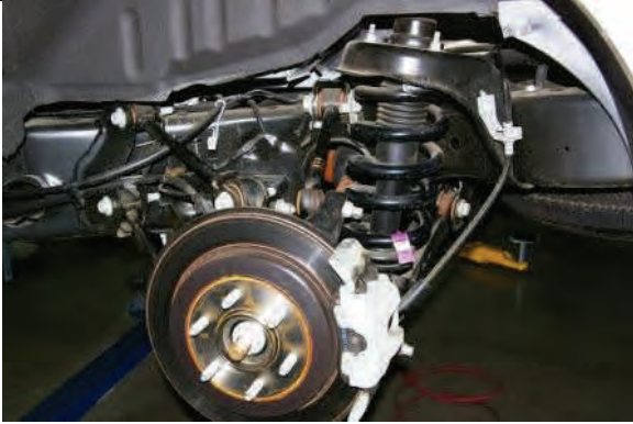
Raise rear of vehicle remove wheels/tires, support frame