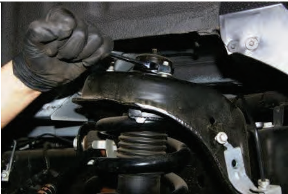
Remove upper strut mounting hardware.