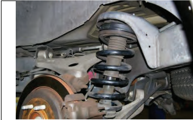
Remove rear wheels/tires and support frame.