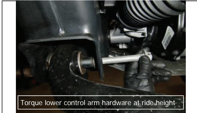
Lift lower control arm into position and reinstall bolts.