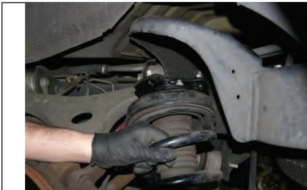
Reinstall strut with new nuts and reverse removal steps

Note: It may be necessary to loosen the upper and lower control arms at the frame pivots in order to ease reinstallation of strut assembly. If this is the case make sure to re-torque these bolts at ride height with vehicle on ground. Reinstall wheels/tires and torque. Re-check all work performed and test drive vehicle. Have vehicle aligned.