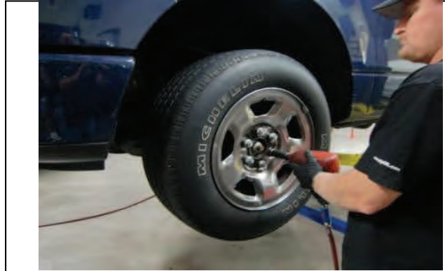
Lift vehicle securely and remove wheels/tires.