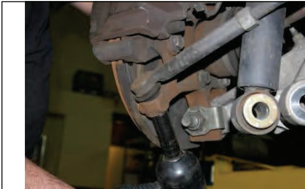
Remove tie rod nut and carefully strike spindle to break loose