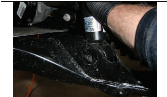
Push down suspension and reinstall lower strut bolt and nut.

Make sure to replace ABS wiring clips onto top of strut mounting studs. Reconnect sway bar end links and reinstall front wheels/tires.