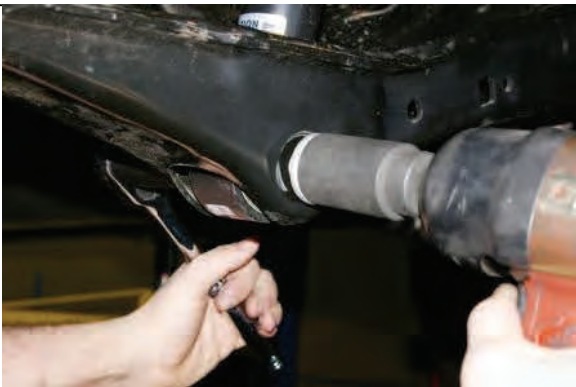
Torque lower shock/control arm bolts with vehicle on ground.

Next, reinstall wheels/tires lower to ground and torque. Then tighten lower strut mounting hardware and inner lower control arm hardware to spec. as shown in the next step.