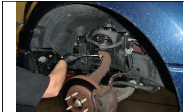
Loosen upper ball joint nut, but do not remove.