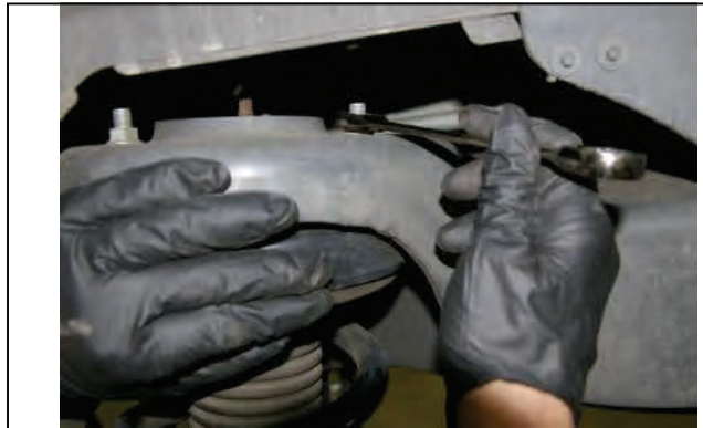
Remove upper strut mounting nuts