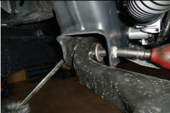
Loosen and remove front lower control arm bolt and nut