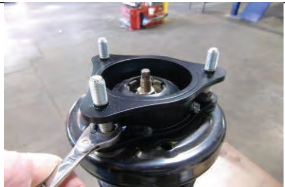
Install new strut extension with OE hardware and tighten.