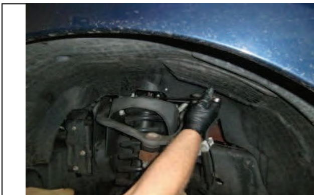
Loosen upper strut mount nuts.