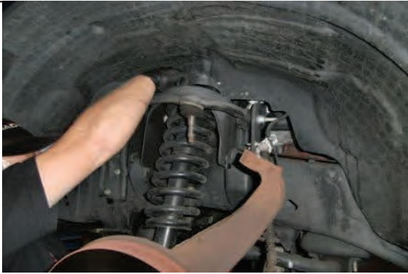
Remove top strut mount nuts and remove assembly.