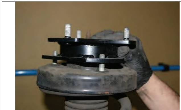
Install strut extension with OE hardware and tighten