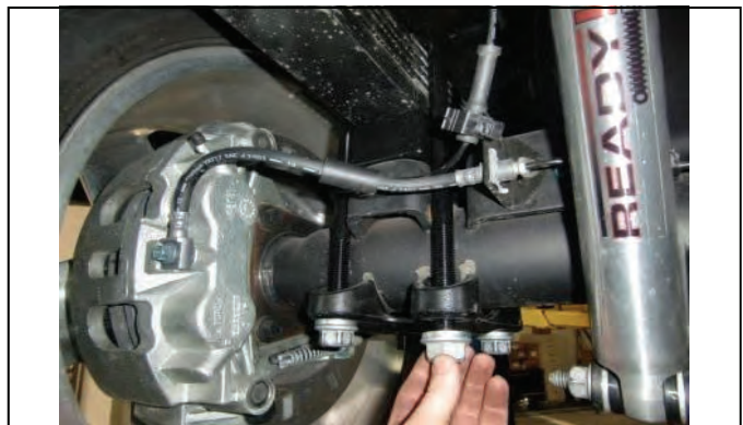
Raise axle aligning center pin and install new U-bolts/nuts.