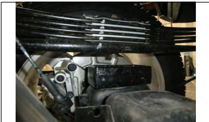
Note slight taper on block, shorter end towards front of truck