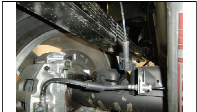
Remove U-bolts and lower axle to allow lift block positioning