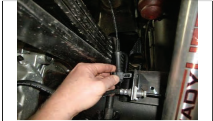
Release ABS clip from bracket on axle.