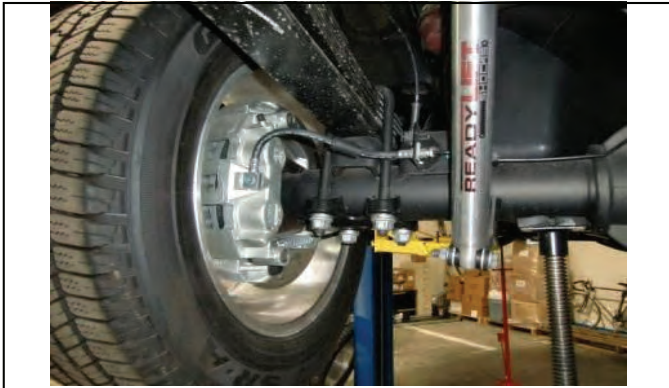
Raise and support vehicle on level ground and support frame.