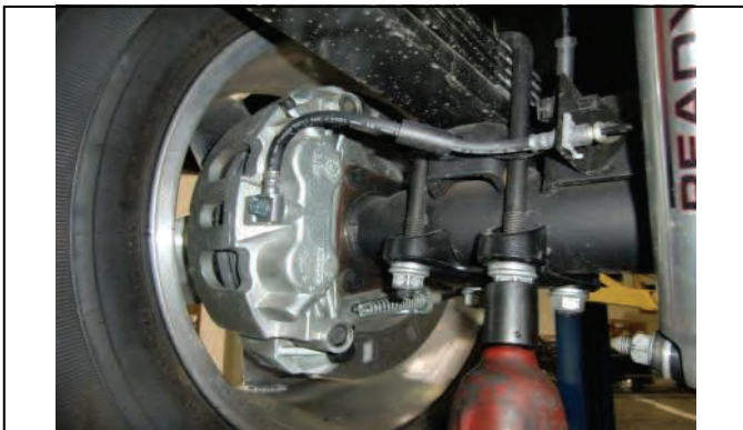
Support axle and remove U-bolt hardware and axle bracket