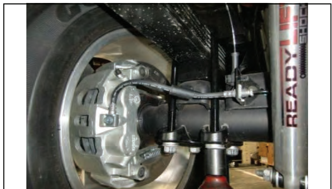
Torque U-bolts with vehicle on ground and re-clip ABS wire