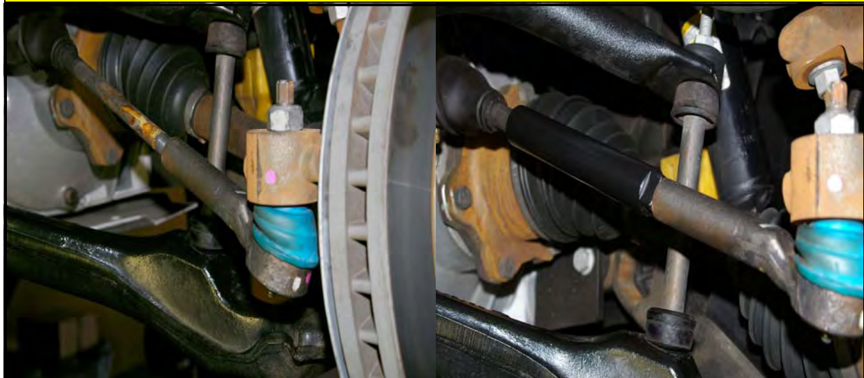
Before ReadyLift® Tie Rod Support Kit

*It is also recommended that you adjust your headlights whenever your vehicle's ride height is altered.