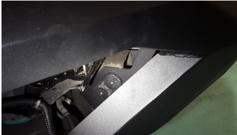
Figure 7 – Stud Plate Orientation