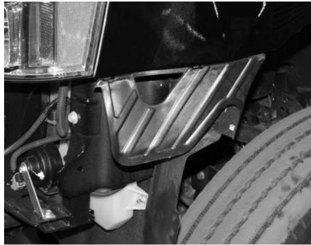
Figure 5 - SUPPORT STRUCTURE LOCATION