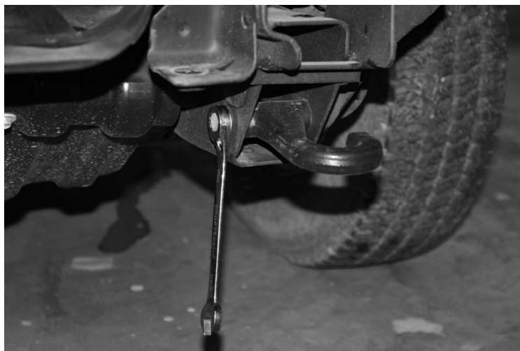
Figure 4 - TOW HOOK