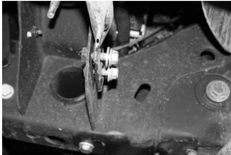
Figure 2 – Outer Bumper Support Screws