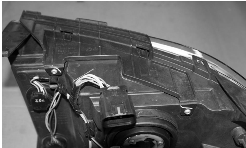
Figure 6 - TORX LOCATION