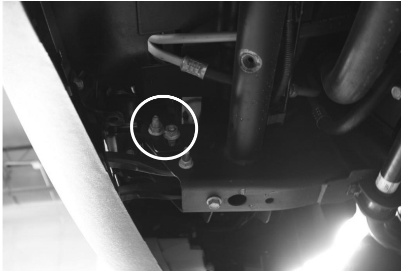
Figure 3 - STUD PLATE NUT LOCATION