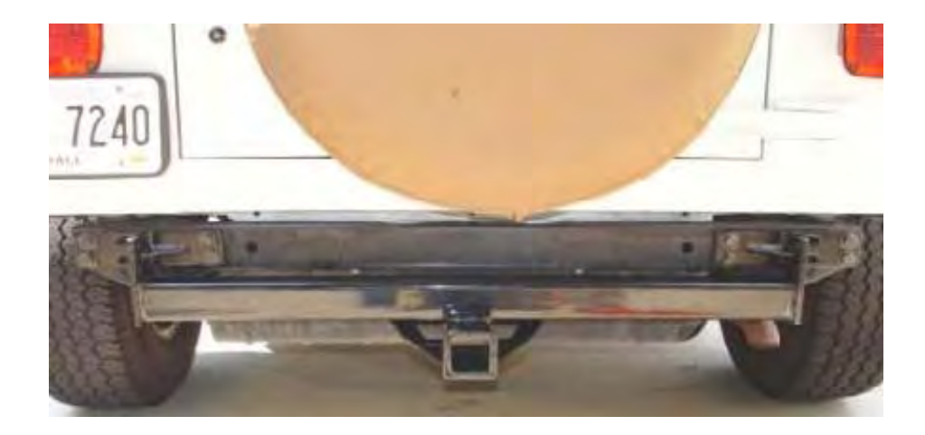
Step 5: Using (1) 10mm bolt, (2) 10mm flat washers, (1) 10mm lock washer, and (1) 10mm nut at each of the 8 holes, attach the hitch to the rear frame. Tighten all hardware at this time. Installation is now complete. (Figure 9)