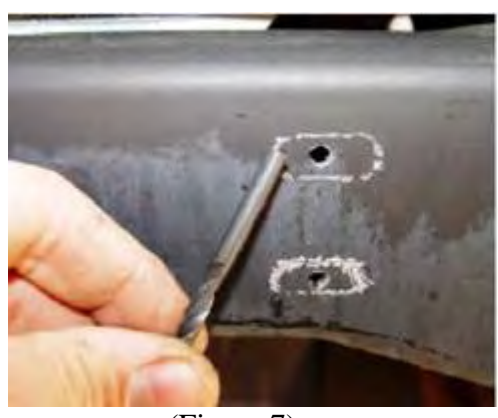
Step 4: Drill the locations that you just marked to ½". It is recommended to use a pilot hole 3/16" first. CAUTION: Be very cautious in this step. The vehicles fuel take is located behind the frame. (Figure 7, 8)

Jeep Rear Hitch (Part # JH44) 1987-2006 Jeep Wranglers