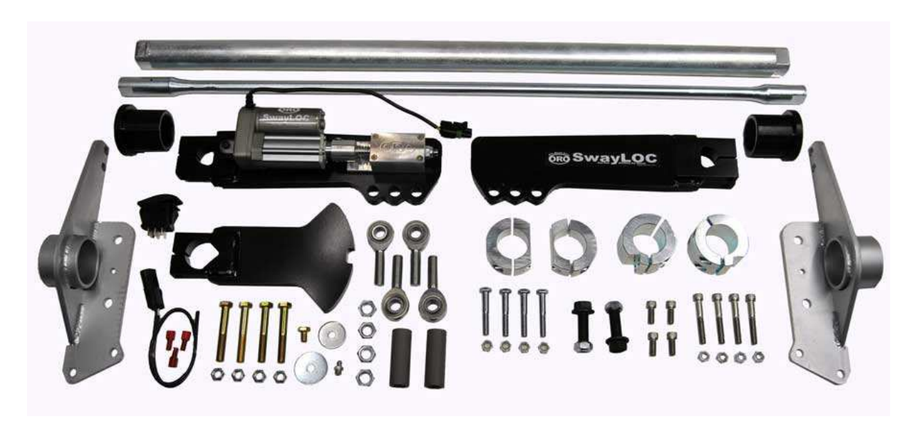
SwayLOC™ kit components