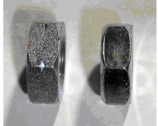
Jam Nuts with marking are left hand thread nuts

Locate the 4 tie rod ends. There should be 1 right hand \frac{3}{4} jam nut, 1 left hand \frac{3}{4} jam nut, and 2 left hand 22mm – 1.5 jam nuts. The left hand nuts are marked with a tick on each of the 6 flat intersections as shown above.