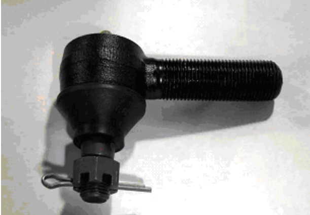
Tie Rod shown assembled. Note position of cotter pin.

Install grease zerks and boots. Tie rod ends can be greased at this time or once in the vehicle.